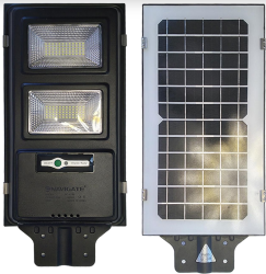
SOLAR STREET LIGHT 60W Cool White (6000K) Motion Sensor Day/Night Sensor IP65