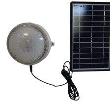
SOLAR WALL LIGHT 6W Cool White (6000K) Day/Night Sensor