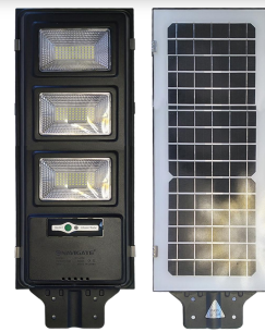
SOLAR STREET LIGHT 90W Cool White (6000K) Motion Sensor Day/Night Sensor IP65