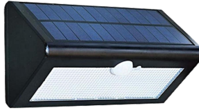
SOLAR FOOT LIGHT 5.6W Cool White (6000K) Motion Sensor Day/Night Sensor