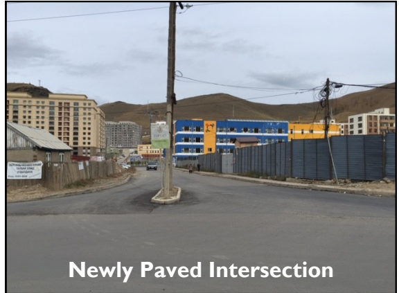
Newly Paved Intersection

You may have noticed that there have been improvements made to the road that we all travel each day to get to ASU. Specifically, the road between ASU and the 11th Khoroo's road has been fully repaired. ASU has a parent to thank for making this much needed upgrade possible.