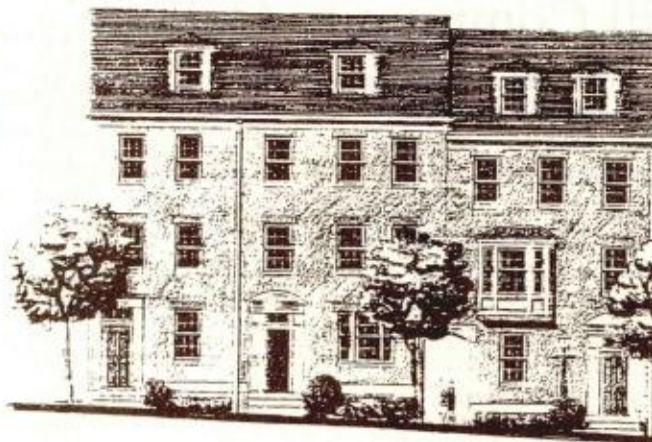
Saint Francis Way Elevation

would go along with the community's wishes. The two options would be a dumpster or compactors in each unit to decrease the volume and then people would put out their own trash for collection.