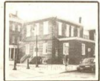
Building 120, Sixth Street Charlestown, MA 02129