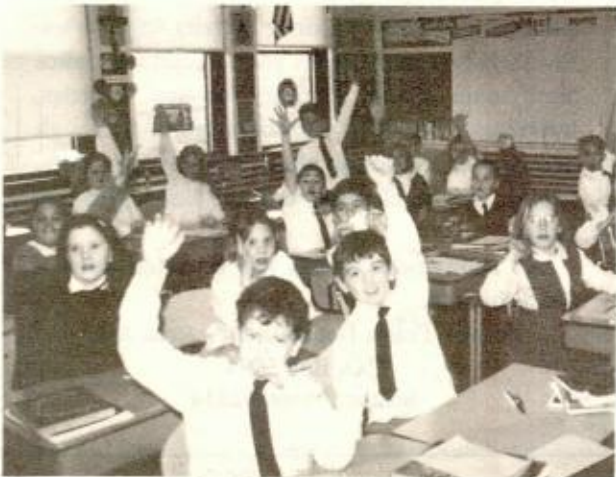
GRADE 3 students are eager to respond!

Charlestown Catholic Elementary School is flourishing! It will soon be time to open its doors to welcome new students in kindergarten and grades one through eight who may be interested in a Catholic education in Charlestown.