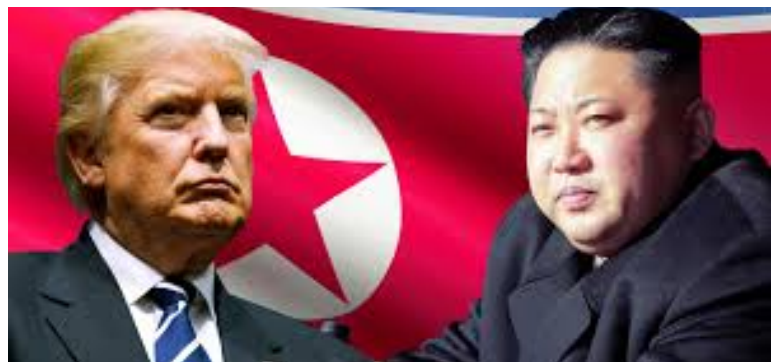
The North Korean Problem pg 4