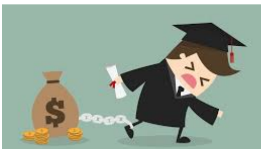
College Tuition at an All Time High pg 3