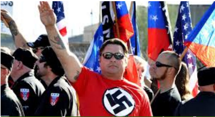
A Wave of Terror: Neo-Nazis and White Nationalists Strike pg 3