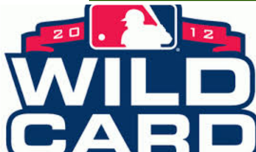
Winner Takes All- The MLB Wild Card Game pg 9