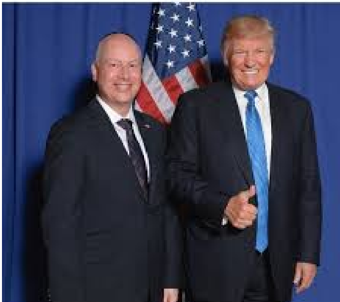
Exclusive Interview with Jason Greenblatt pg 2