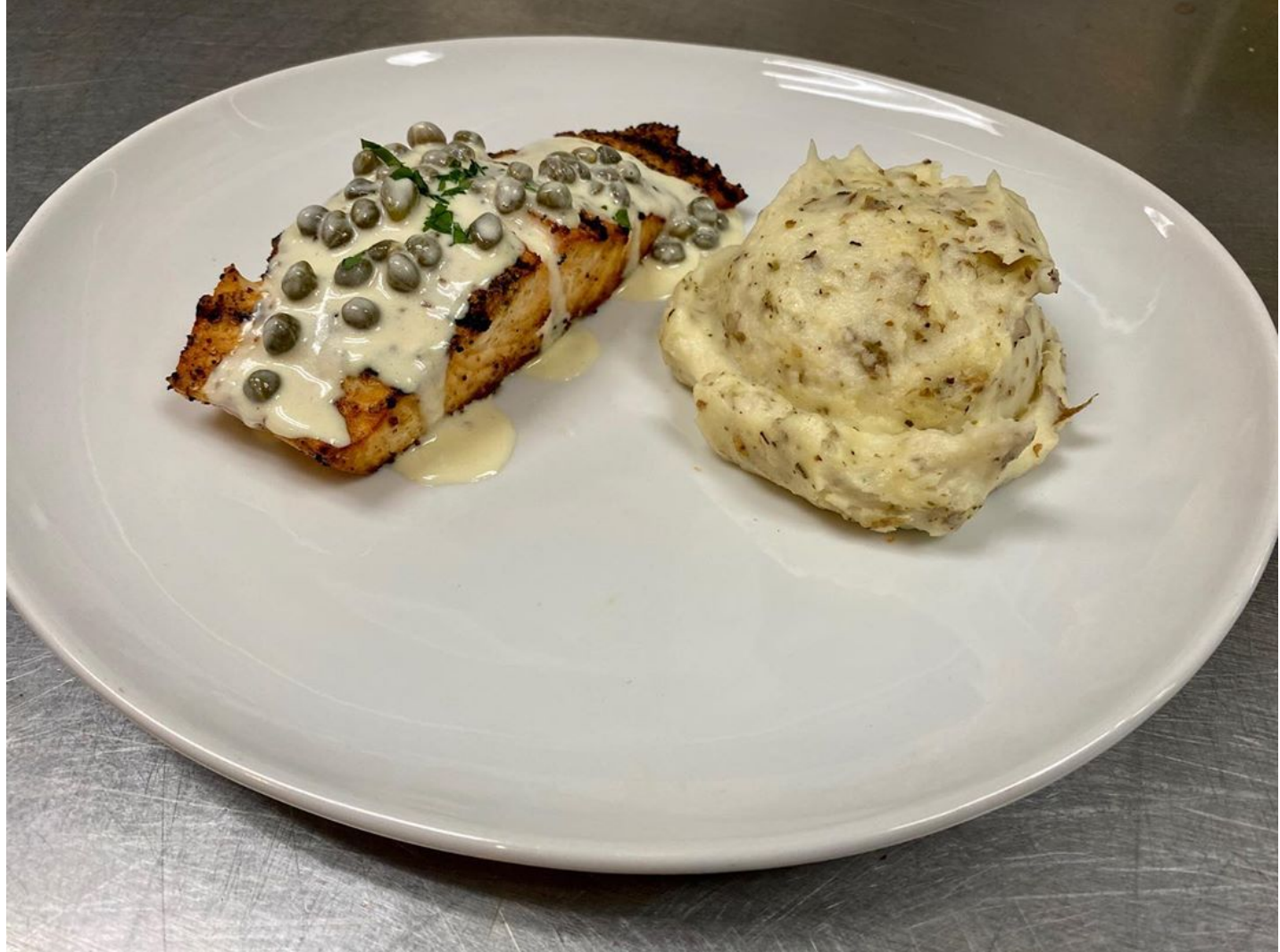
I never follow the newest trending workout or diet fads. I keep it old school. I lift heavy, I cardio, I feed, I hydrate. No tricks no gimmicks.