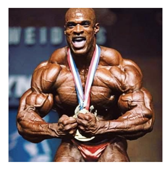
Proper Administration and Timing of Turinabol Dosage. Turinabol exhibits a half-life of 16 hours, which is considerably long for an oral anabolic steroid when other compounds such as Dianabol are taken into consideration with its half-life of 4.5 - 6 hours. As a result, there is normally no requirement to split up Turinabol doses throughout ...