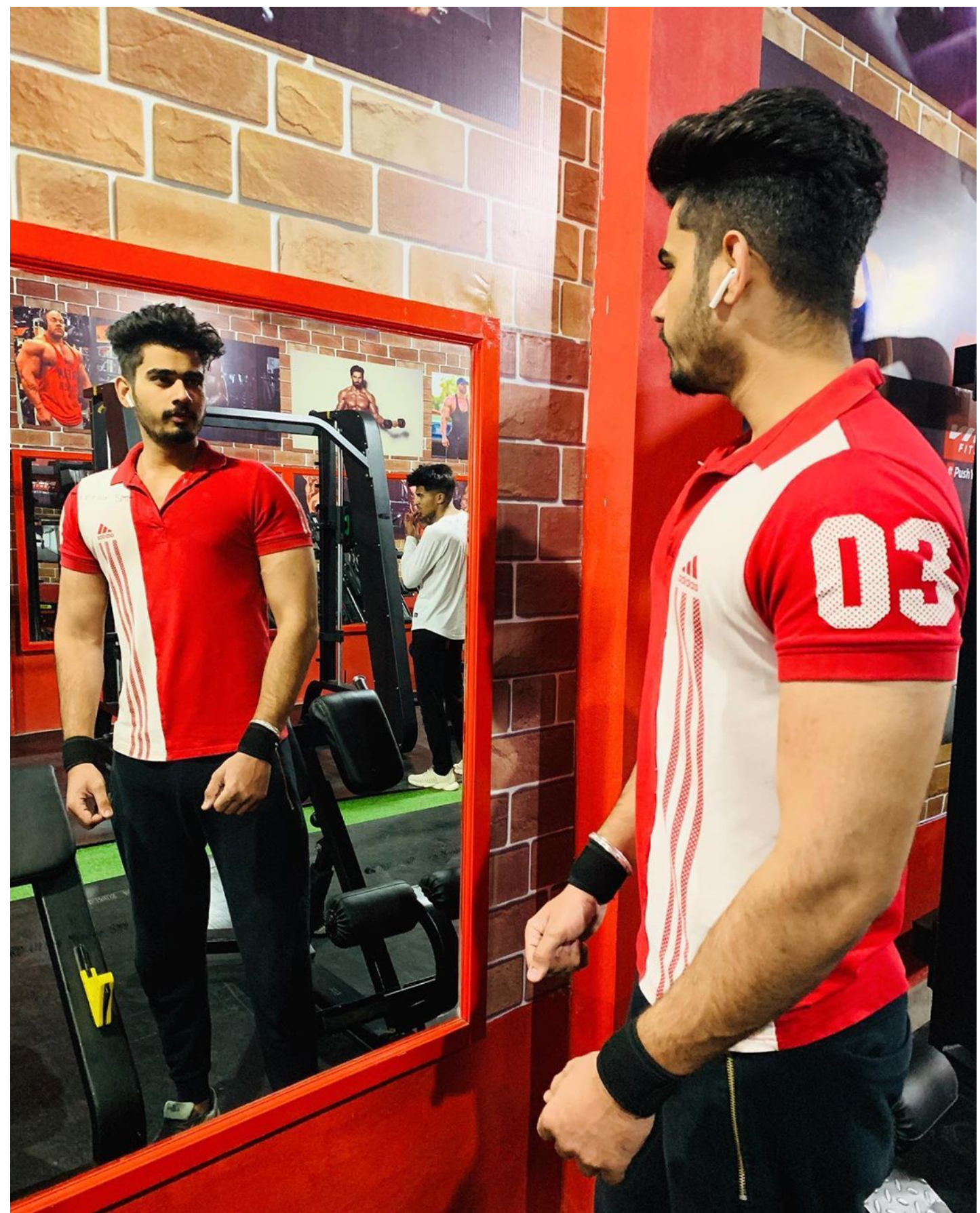
□ #life #disneyland #like4like #gym #instalike #beauty #instagram #fitness #fit #vintage #sneakers #love #life #style #disney #hair #tattoo #fashion #designer #disneyworld #instagood #makeup #shoes #photooftheday #kick #instafood #model #cars #tattoos #bodybuilding#hair 863