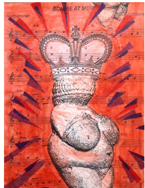
say yes collage