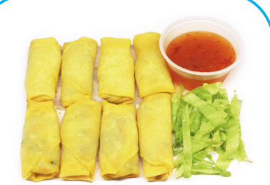
2. SPRING ROLLS Crispy spring rolls with vegetable fillings served with sweet chilli sauce

OPENING TIME: TUES - SUN: 11:00 - 23:00 (MONDAY CLOSED)