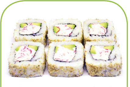
27. CRABMEAT MAKI ROLL SET Surimi crabmeat, avocado and mayonnaise roll with sesame