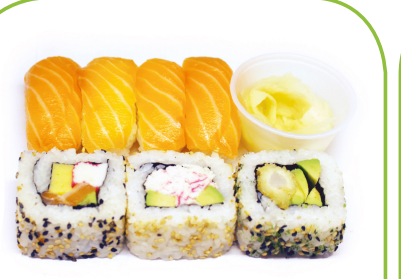
21. CHUMAKI SET Salmon nigiri, assorted maki served with ginger