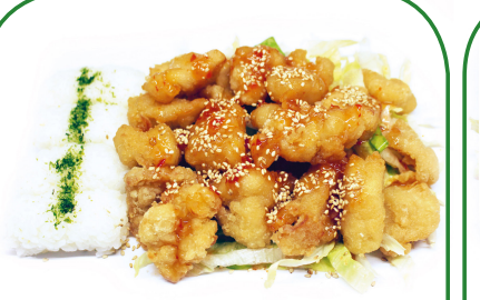
15. SWEET&SPICY CHICKEN BENTC Tender chicken balls in batter with sweet & spicy sauce and sesame served with nori rice £ 5.50