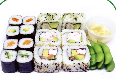
10. MIXED MAKI SET Crabmeat, tempura, happyroll maki and assorted hosomaki served with edamame & ginger £ 6.00