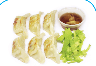
5. CHICKEN GYOZA Dumplings with chicken and vegetable fillings served with ginger vinaigrette