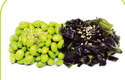
29. WAKAME SALAD Wakame and edamame in a wasabi & yuzu dressing topped with sesame £ 2.50

31. MIXED NIGIRI SET Salmon, prawn, squid tamago and octopus nigiri