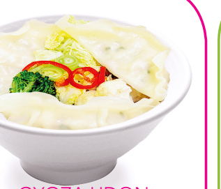
37. GYOZA UDON Chicken gyoza, vegetables in chicken broth with udon, topped with coriander & spring onions