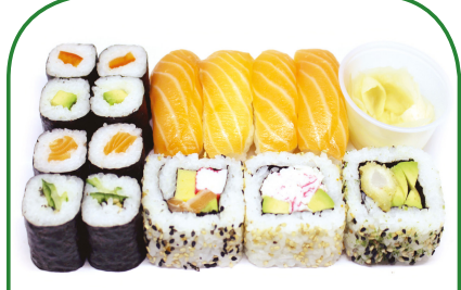
9. HARMONY SET Salmon nigiri, assorted maki and hosomaki served with ginger