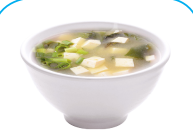
1. MISO SOUP Traditional Japanese soup with soft tofu & wakame