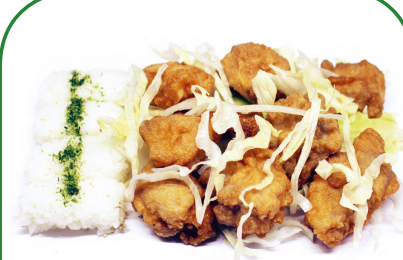
15B. CHICKEN KARAAGE BENT Tender marinated chicken pieces in batter with mayo served with nori rice