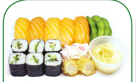
17. HAPPY CLASSIC SET Salmon nigiri, assorted hosomaki tempura prawn and crabmeat served with edamame & ginger