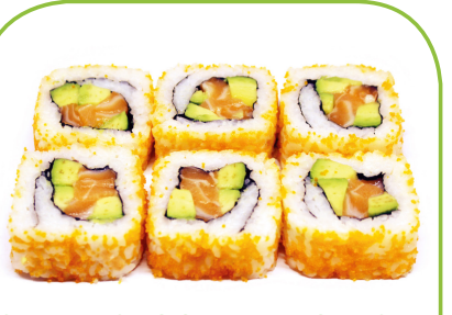
25. MASAGO MAKI ROLL SET Salmon and avocado roll with