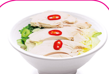
35. CHICKEN UDON Seasoned chicken breast, vegetables in chicken broth with udon, topped with coriander & spring onions