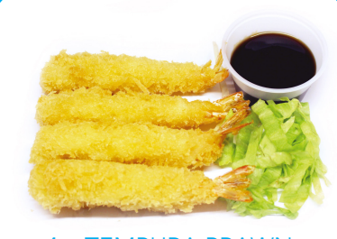
4. TEMPURA PRAWN Succulent prawn wrapped in