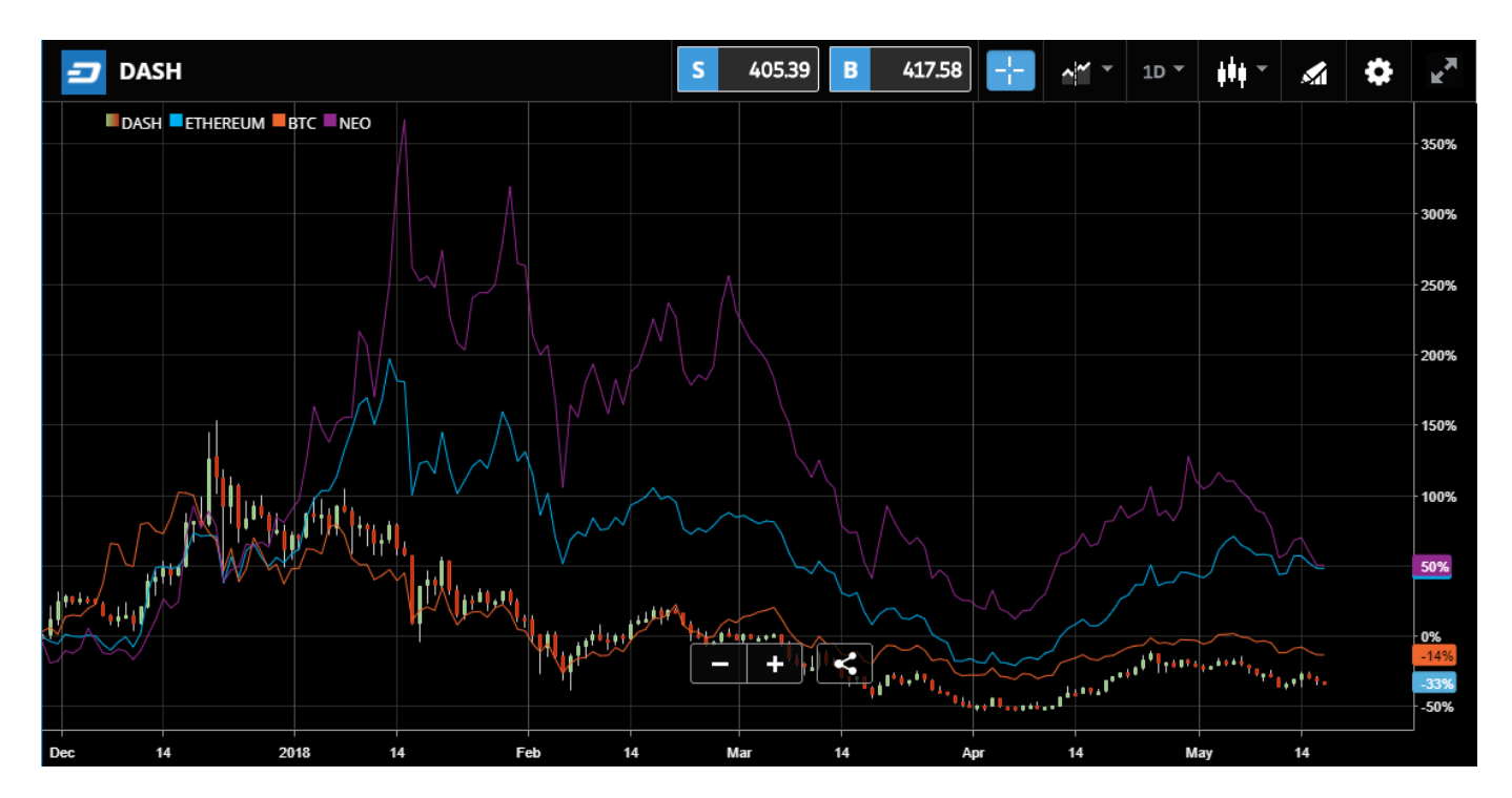
Exhibit 2: Evolution of DASH/USD price since December 2017, compared to other cryptocurrencies ( Neo , Bitcoin and Ethereum ). Evolution is presented as % of the value as of December 1<sup>st</sup>.

bottom support at $280. During April, it climbed back to $500 and has since remained relatively stable around the resistance established in February 2018 at $400. The medium-term trend of the price will depend on whether Dash is able to secure this support, as well as the result of testing higher resistances at the $600-700 levels.