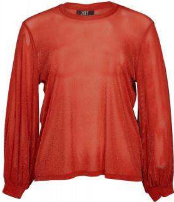
LAILA BLOUSE 193-3147