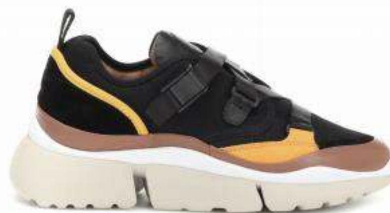
CHLOÉ SONNIE SNEAKERS AT MYTHERESA.COM € 495

"These sneakers have been on my watchlist for ages. They are so cool, but also a bit pricy."