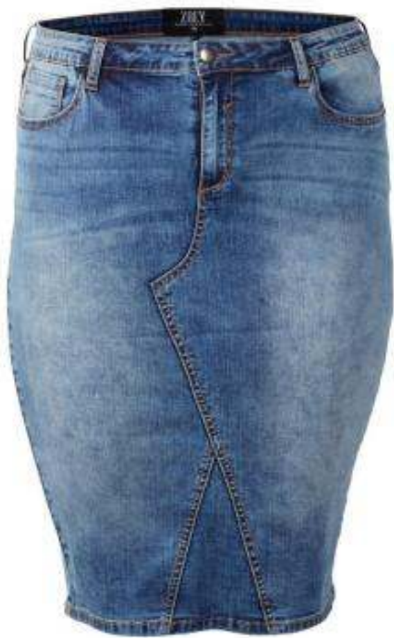
FIA SKIRT 193-9920

Punch Monday in the face with a denim on denim look. Make a twist and use a cute chiffon top with it.