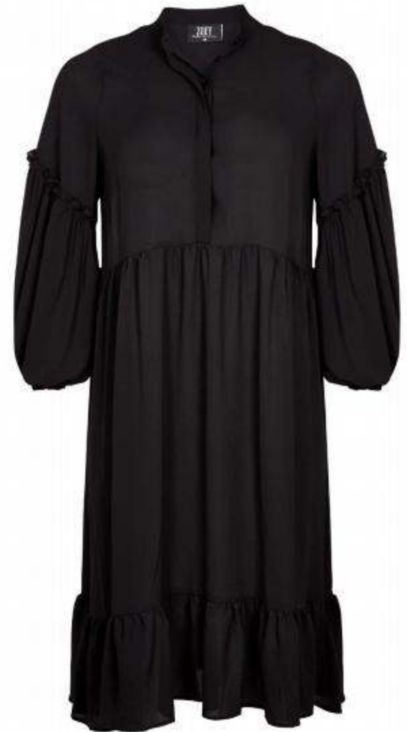
ARIEL DRESS 193-0423