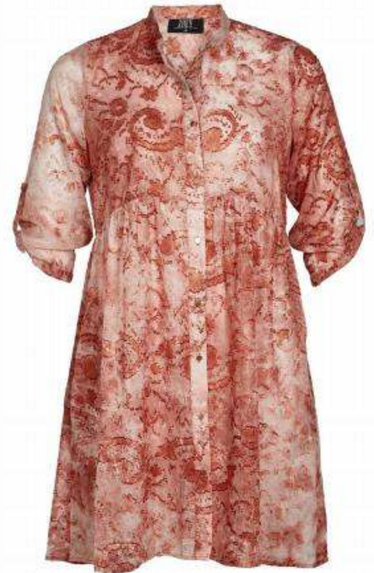
PENNIE DRESS 193-3023