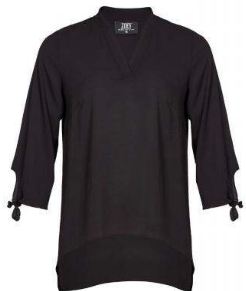
ARIEL BLOUSE 193-0445