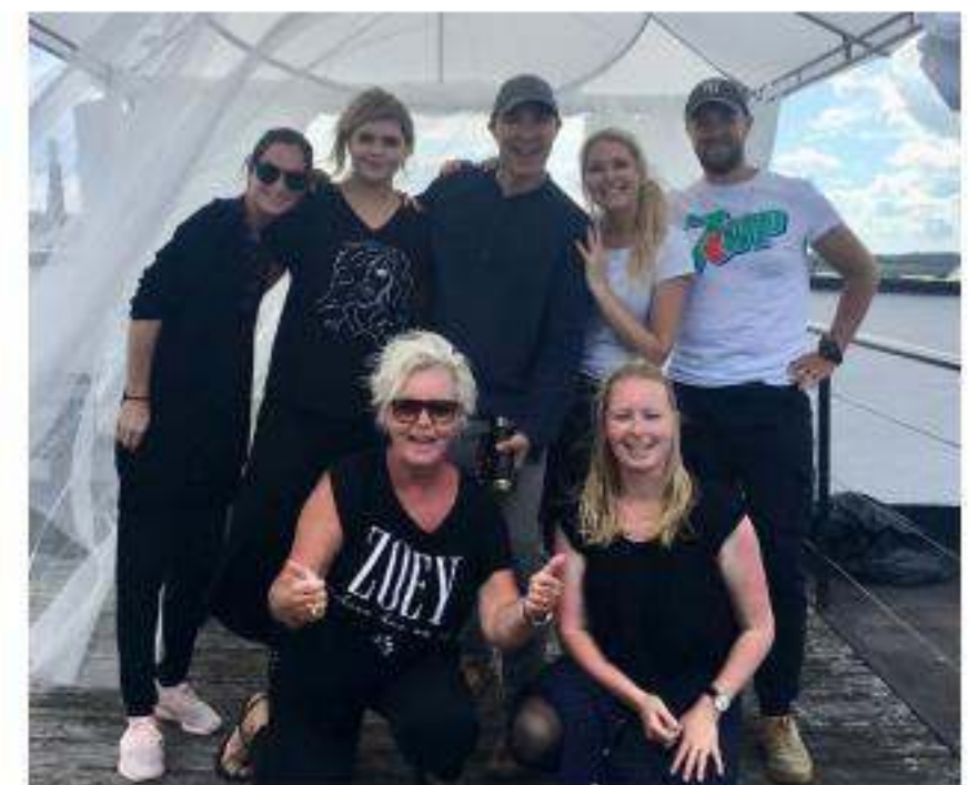
The whole team at the end of the best day. We bring home amazing memories, gorgeous photos and great laughs. Thank you so much everyone!