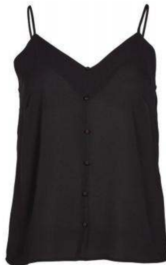
ARIEL STRAP TOP 193-0446

Black is the new black, Choose black to mix with everything a wear it