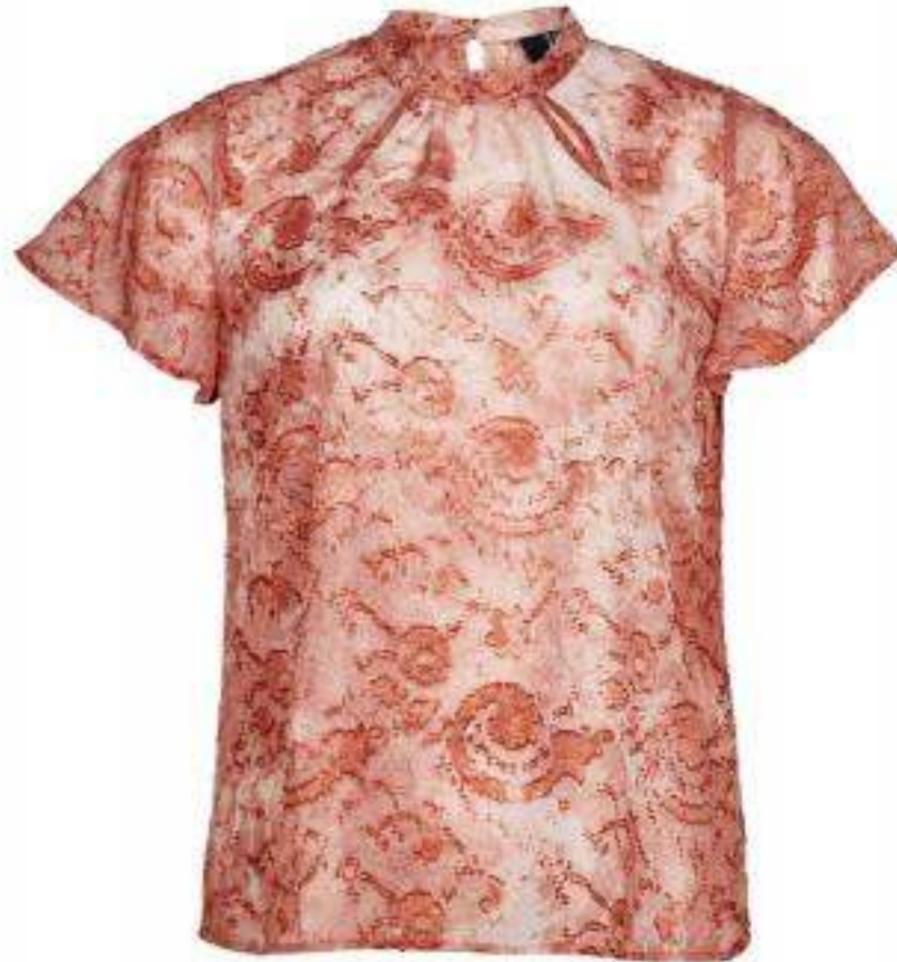
PENNIE BLOUSE 193-3047