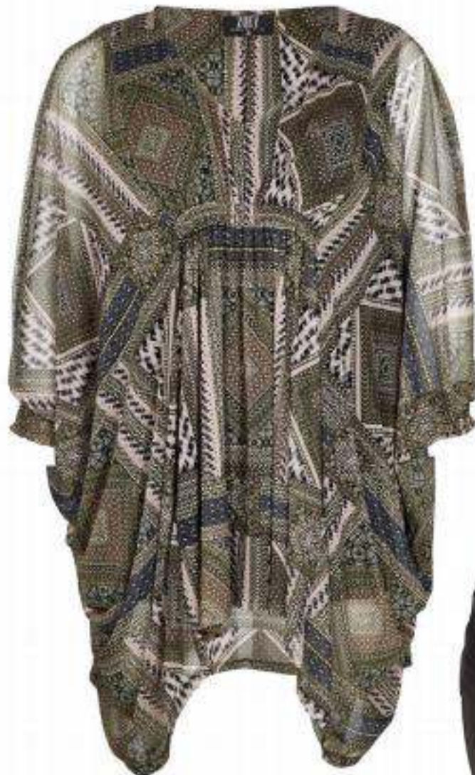
IRIS TUNIC 193-1426