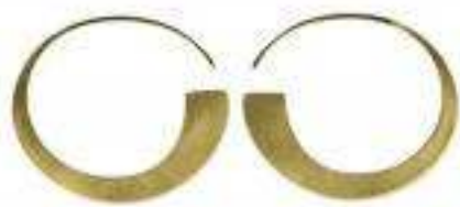
PURE BY NAT GOLD HOOP EARRINGS