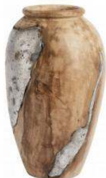
MUUBS NOA VASE € 194