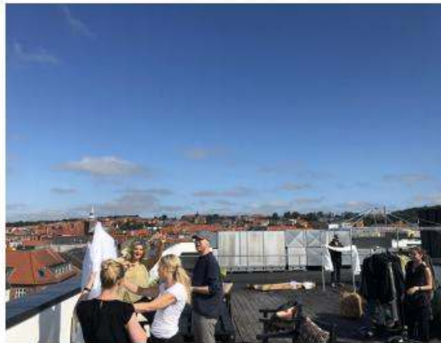
The whole team in action! Everyone has a part to play and all hands are needed. Especially to eat the two BIG boxes of candy we always bring to the set.