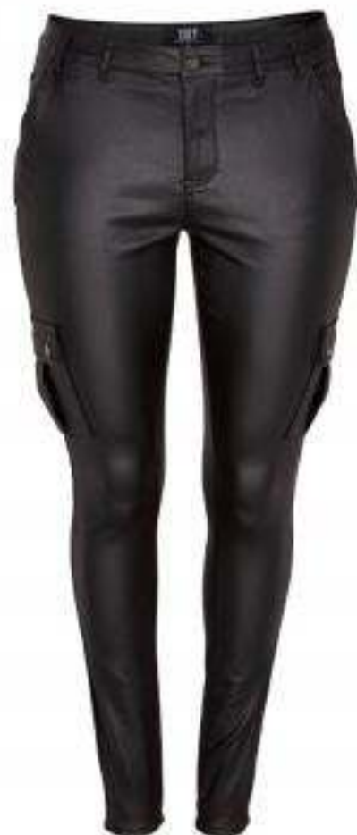
BRIANNA PANTS 193-9716