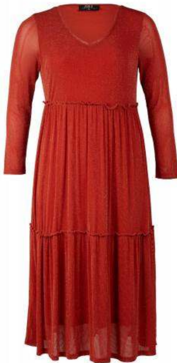
LAILA DRESS 193-3123