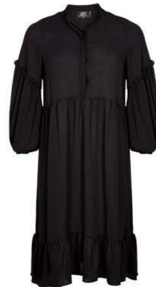
ARIEL DRESS FROM FUTURE AWARENESS 193-0423