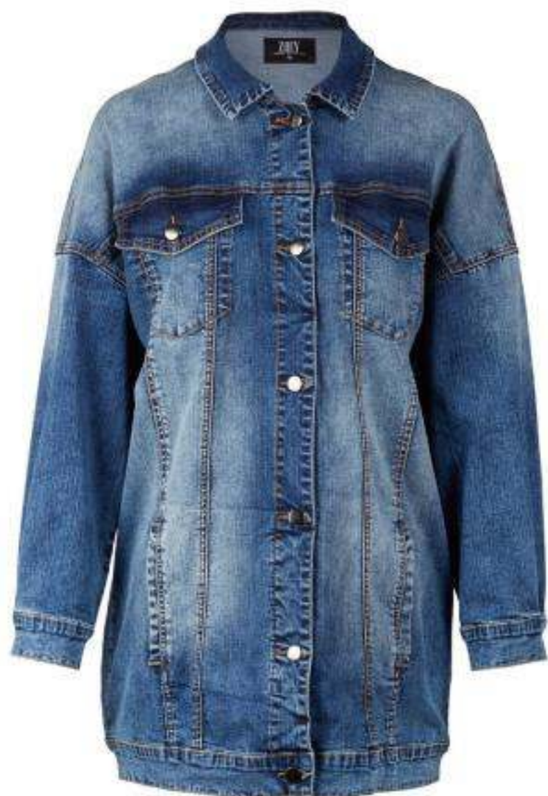
FIA LONG JACKET & FIA SKIRT 193-9935 & 193-9920

"The ARIEL dress is not only super awesome but also from the new Future Awareness line. It just adds so much history to the dress, it will ecco in me everytime I wear it"