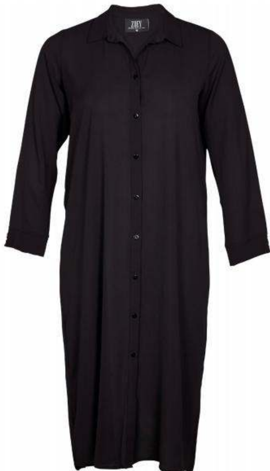
ARIEL LONG SHIRT 193-0425