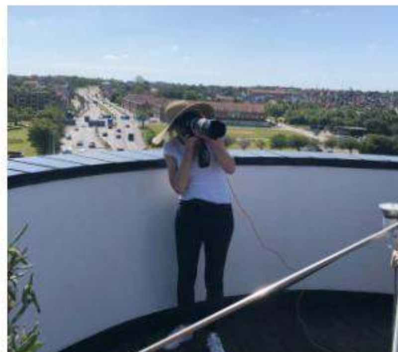
A huge Thank you to Spar Invest Huset for letting us unto the roof. Look at the view we had all day! Helle almost couldn't help shooting in that direction.