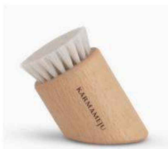
KARMAMEJU RENEW FACIAL BRUSH € 40

"The denim pieces FIA are super smooth and have so much stretch. The long jacket has the ability to make any outfit a little more tough, which is something that I love"