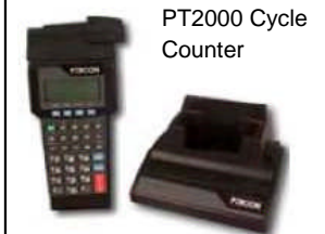
PT2000 Cycle Counter