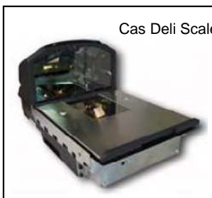
Cas Deli Scale