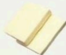
GRASS FED BUTTER