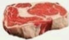
GRASS FED BEEF