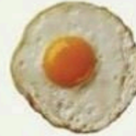
CAGE FREE EGG