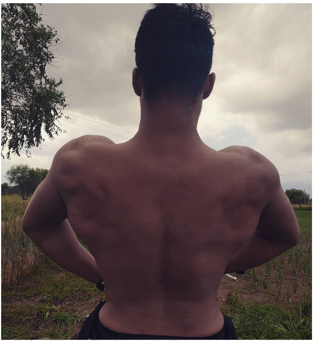
#powerlifting #fitness #bodybuilding #gym #deadlift #squat #dankmemes #strength #weightlifting #benchpress #workout #strongman #strong #bench #motivation #powerlifter #squats #strengthtraining #power #muscle #gains #deadlifts #gymmotivation #powerbuilding

\underline{https://steemit.com/gym/@vrotobor/sustanon-250-10ml-vial-organon-steroids-for-sale-online-cheap}