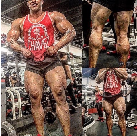
I can tell I haven't deadlift in a couple weeks but did 465 for 4x2 and then hit some pause 365 for 4x4

b) it suppresses the actions of somatostatin, thus both these pathways brings about an increase in the level of endogenous growth hormone. GHRP-2 therapy requires a daily dosage administered via subcutaneous, oral or intra-nasal route. Growth Hormone releasing peptide 2 also possesses an ability to vigorously boost levels of IGF-1.