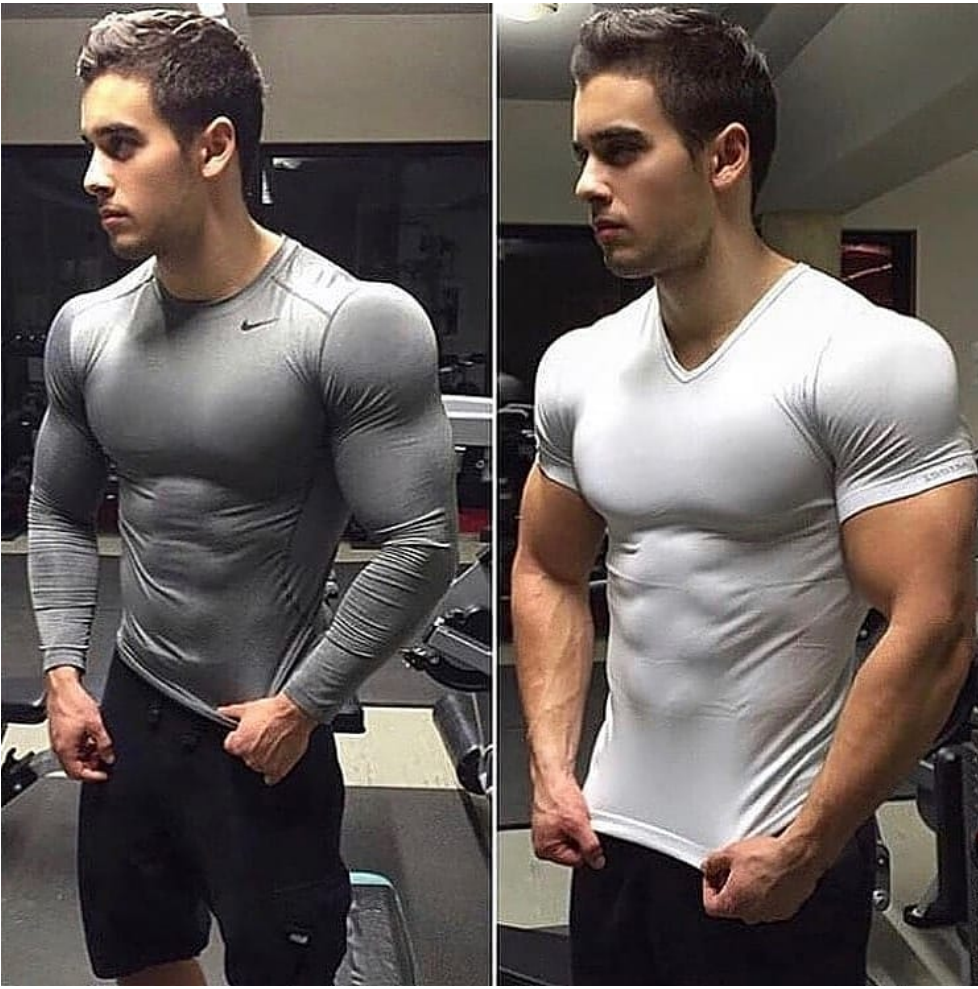
Tri Tren Mix 200 LA Pharma. You are here: Home. Injectable Steroids. Tri Tren Mix 200 LA Pharma ...