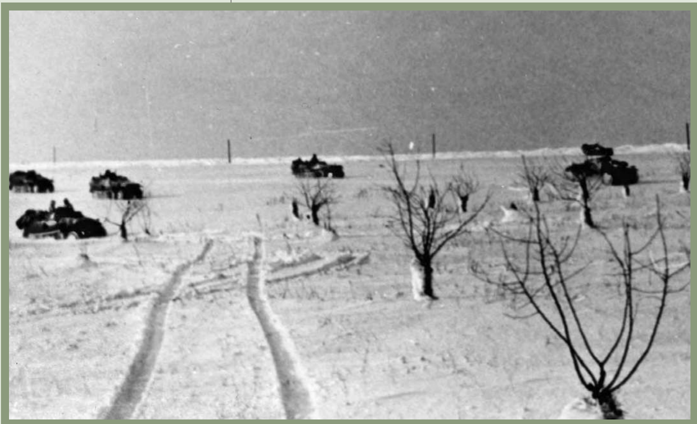
Spread across the wintry landscape of the Soviet Union, German armored vehicles advance eastward toward the major cities of Russia. The German timetable was upset by tenacious Soviet defenses and then compounded by horrific winter weather.

Army took the city of Azov-on-the-Don. Around Slavyansk, where fighting was still raging, Red Army units also took the town of Kramatorsk, some 15 kilometers south of the city.