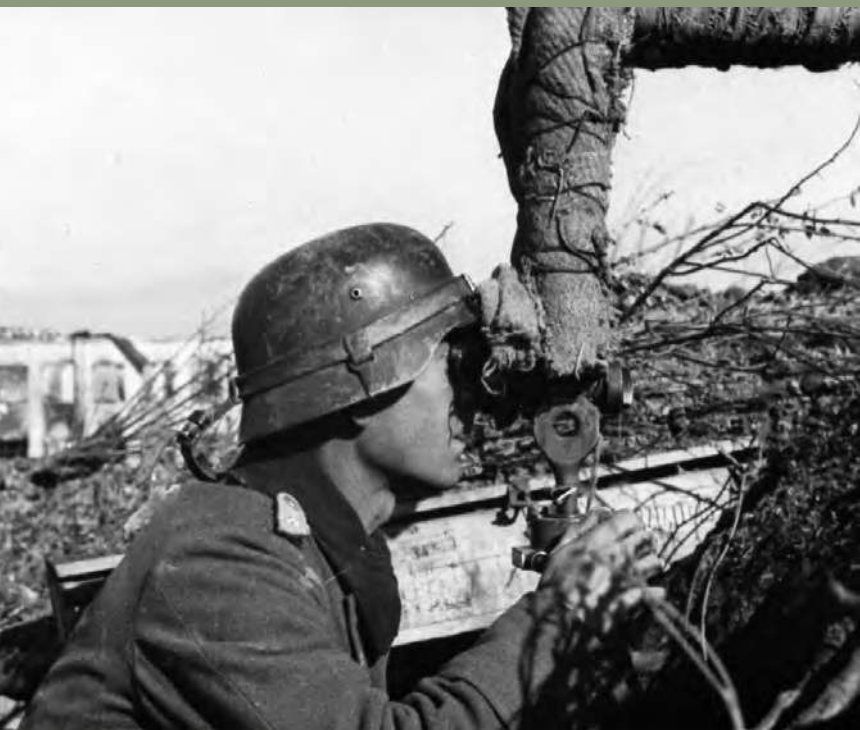
ABOVE: During the catastrophic German defeat at Stalingrad, a Wehrmacht soldier peers from cover through a telescopic viewer. The distant Soviet Red Army tightened the ring of steel around the Germans at Stalingrad until they capitulated in February 1943. OPPOSITE: Uniformed against the cold, soldiers of the Red Army gather around a campfire during a lull in fighting on the Eastern Front. The Soviet effort to liberate the Don Basin, Operation Gallop, proved overly ambitious.

Von Manstein was also lucky in another regard. While the debacle at Stalingrad was still being played out, he had managed to talk Hitler into allowing most of the German forces in the Caucasus to withdraw before being cut off. By the end of January, many of those units, including the First Panzer Army, were regrouping in the Don Basin. The Fourth Panzer Army, commanded by Col. Gen. Hermann Hoth, was also in the process of getting out of the Soviet trap.