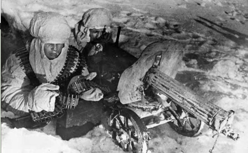
ABOVE: Wearing hooded camouflage uniforms, a pair of Red Army soldiers fires an antiquated machine gun at German positions. The winter weather created a no-man's-land of snow and ice between opposing lines. OPPOSITE: Visiting the Kertsch Front on May 20, 1942, General Erich von Manstein takes stock of the condition of his troops. Manstein developed a reputation as a superb strategist and was one of the most respected generals in the German Army.