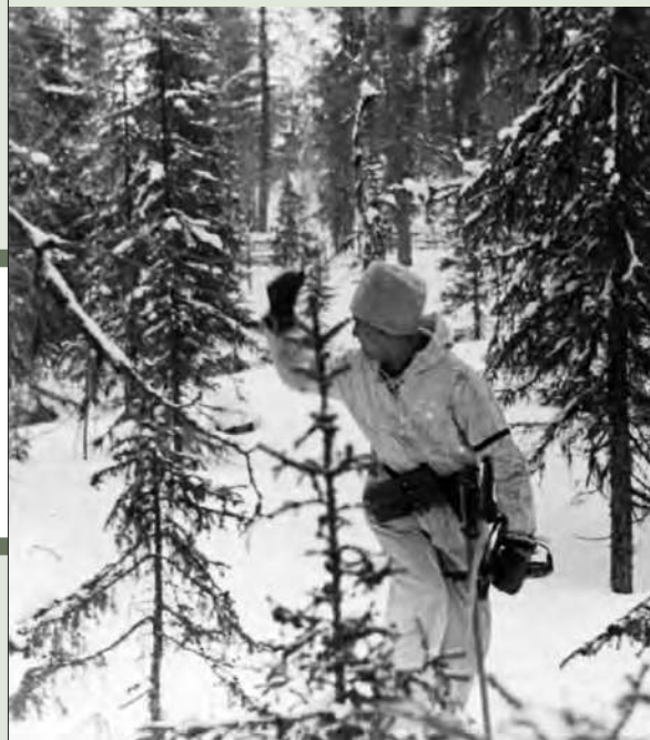
Motioning to his troops to follow quickly, a German soldier leads a detachment through a wooded area of Russia. The winter weather took a heavy toll on the unprepared Germans.

A report from Krasnoarmeiskoye indicated that the newly arrived elements of the 7th Panzer Division were trying to break the 4th Guards Tank Corps. Overcoming