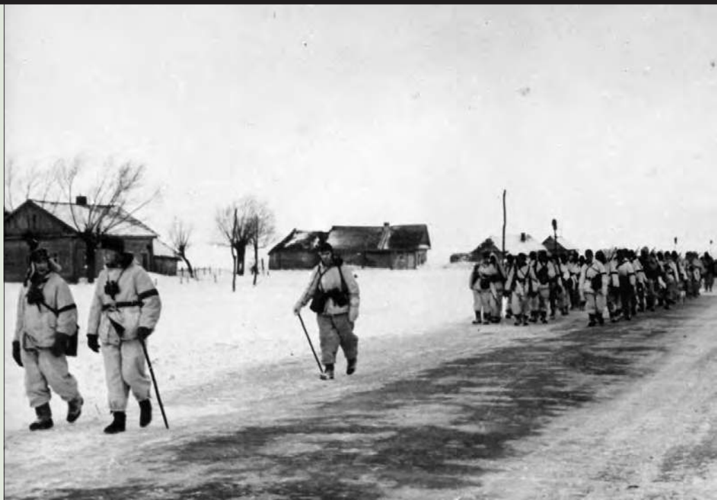
ABOVE: Advancing through a deserted Russian town, German soldiers trek eastward toward the enemy and their crushing defeat at Stalingrad. Although their momentum was halted, the Germans still delivered a bloody repulse to Soviet Operation Gallop. OPPOSITE: Assuming the offensive, Red Army soldiers exploit a breakthrough in the German lines as they ride aboard Soviet T-34 tanks.