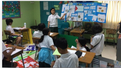
Social Studies Activity by G-5 Voyagers