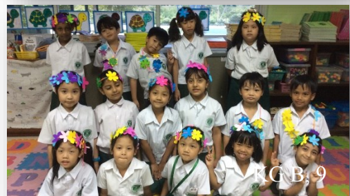
KG B, 9