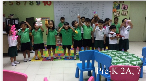
Pre-K 2A, 7