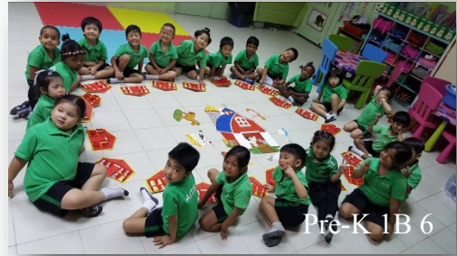
Pre-K 1B 6