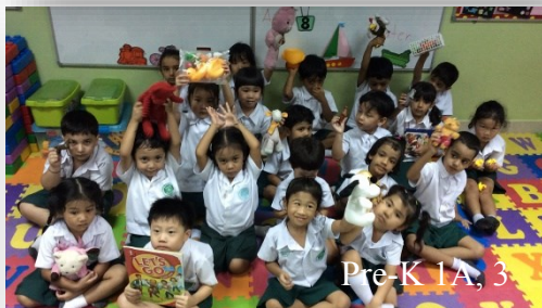
Pre-K 1A, 3