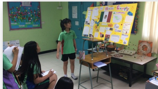
Social Studies Activity by G-5 Voyagers