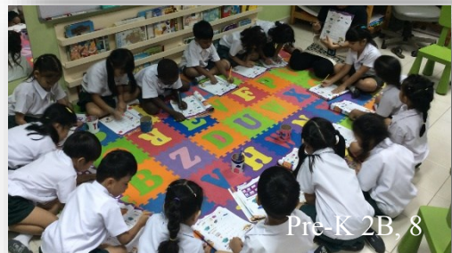
Pre-K 2B, 8