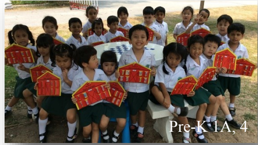
Pre-K 1A, 4