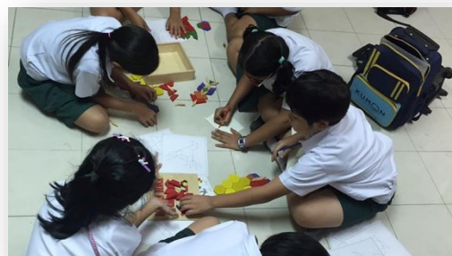
Math Activity by G-3 Bright Owls