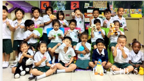
Pre-K 1B, 5