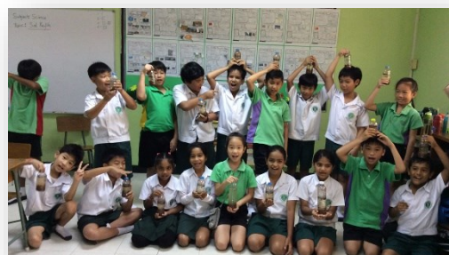
Science Activity by G-3 Unique Unicorns