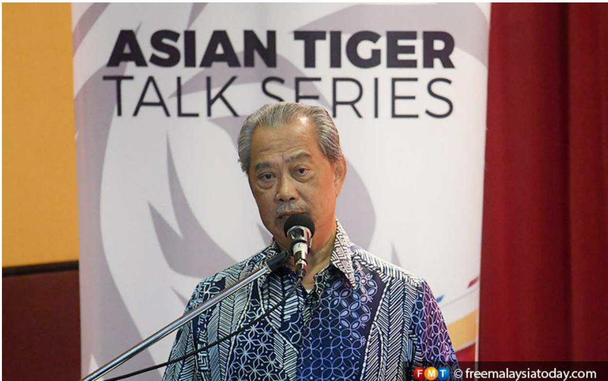
Home Minister Muhyiddin Yassin.

freemalaysiatoday.com/category/nation/2019/08/24/dont-trigger-issues-on-race-religion-royalty-muhyiddin-warns August 24, 2019