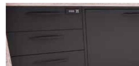
Numbering security lock