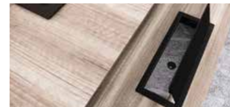
Wire management solution