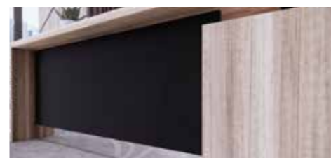
Full length modesty panel