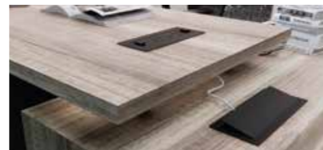
Wire casing profile