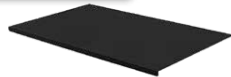
W700*D500*1.2 THK (MM)