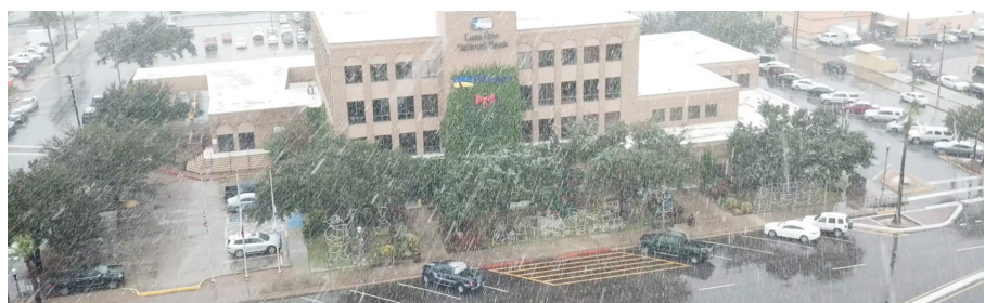
December 8, 2017 - Pharr City Hall covered in snow.

Citizens of Pharr experienced a winter wonderland this year when snow unexpectedly fell across the Rio Grande Valley. It was a magical day to see city hall, the streets, and the community blanketed in white, truly making it a memorable holiday for all!