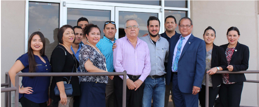
Pharr EDC staff members and PSJA ISD representatives tour Maquila Automotive Services.

In recognition of National Manufacturing Day, Pharr EDC staff coordinated a tour of Maquila Automotive Services. Pharr EDC invited personnel from PSJA ISD’s Career and Technology Department to get a firsthand experience of the company’s day to day operations. With a growing manufacturing industry in Pharr, we are working with PSJA ISD to help prepare for a new generation of higher-skilled workers.