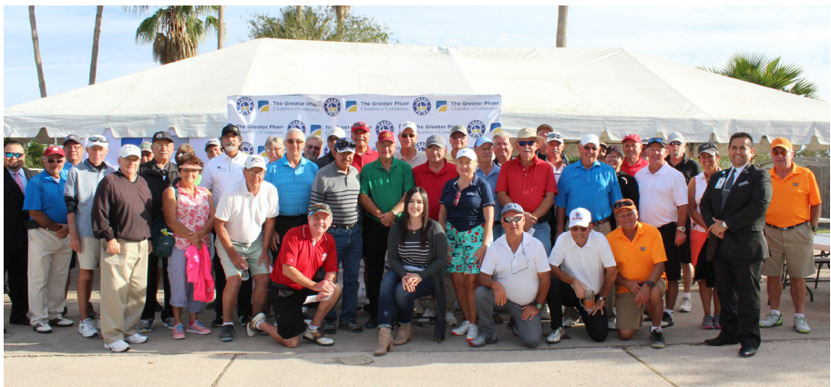
The Greater Pharr Chamber of Commerce hosted its 1st Annual Welcome Back Winter Texan Golf Tournament on December 11, 2017 at the Tierra del Sol Golf Course in Pharr, TX.