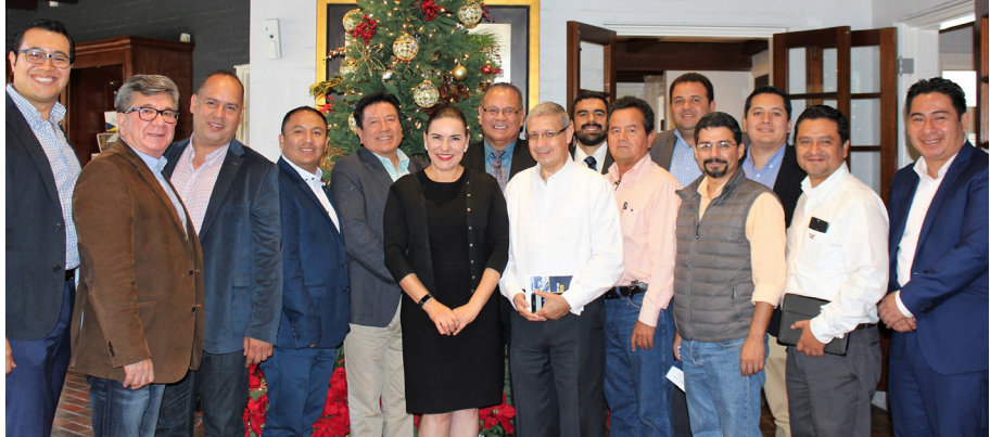
Pharr EDC hosts newly elected mayors from the states of Veracruz and San Luis Potosi, MX.

Pharr EDC meets with numerous Mayors from the States of Veracruz and San Luis Potosi, Mexico who recently took office in January 2018. The Pharr EDC strives to build and strengthen our relationship with our friends in the border region for current and future initiatives with trade, tourism and business investments.