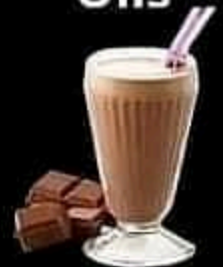
Weight Gain Shakes

Deca-Durabolin contains arachis oil (peanut oil) and should not be taken/applied by patients known to be allergic to peanut. As there is a possible relationship between allergy to peanut and allergy to soya, patients with soya allergy should also avoid Deca-Durabolin (see section 4.3). About Deca Durabolin 100Mg Injection Deca Durabolin 100Mg Injection effectively controls anemia which occurs as a result of kidney disease. the drug can also be prescribed for the treatment of other medical conditions as determined by your health care provider. The drug is known to be an anabolic steroid.