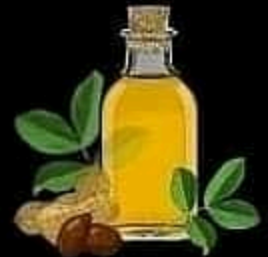
Cook With Oils