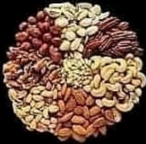
Nuts & Seeds