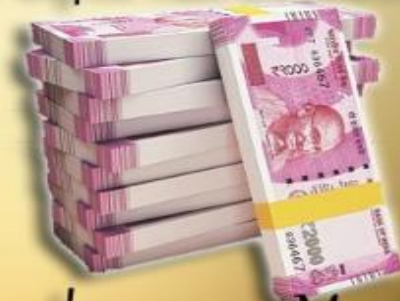
7th level - 1 crore Members Prize worth Rs. 1cr

LDBazaar Lifetime Rewards for Rs. 180 IDs with 10 directs or Rs.180