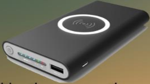
2nd level - 100 members Power Bank