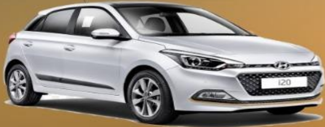
5th level - 1 Lakh Members Car upto Rs. 4 lakhs