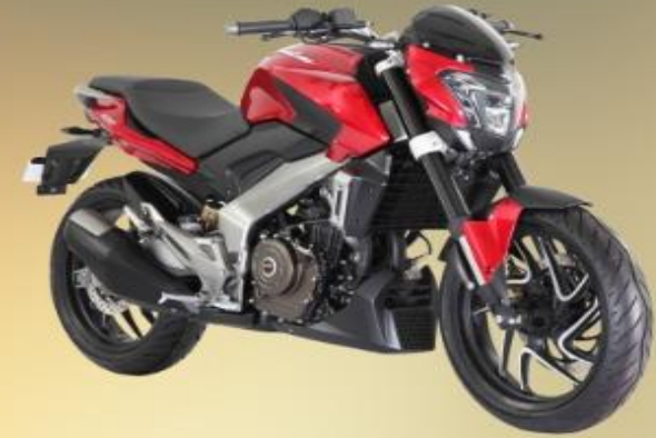
4th level - 10000 members Bike Upto Rs. 60,000/-