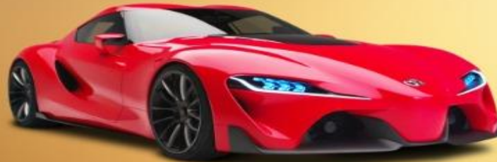
6th level - 10 Lakh Members Sedan Car upto Rs. 10 lakhs