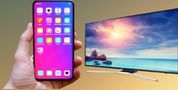
3rd level - 1000 members Android Phone/24" Smart Tv