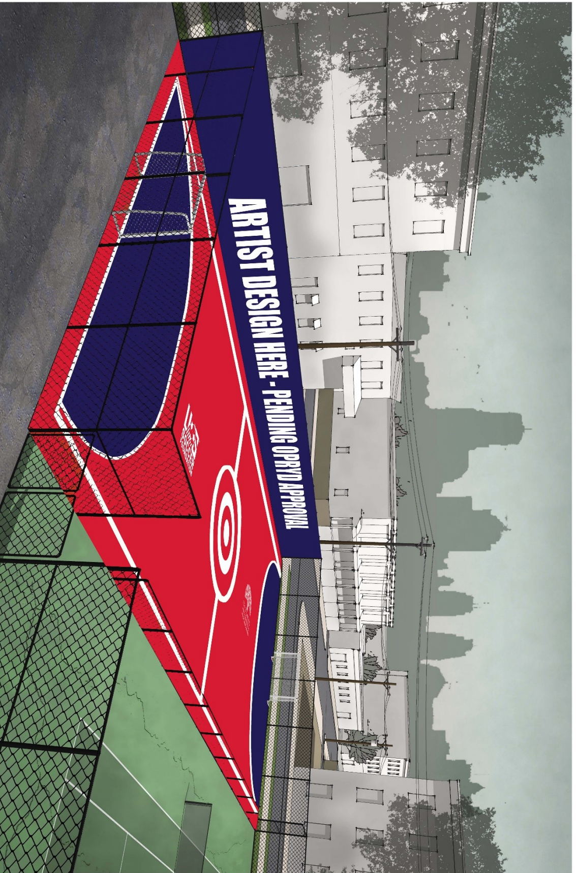
Concordia And Patterson Park Mini-Pitch Soccer Gift-In-Place