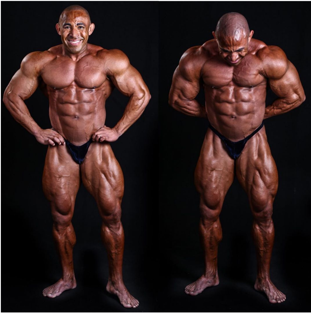
#pic #picoftheday #photography #sexy #sexybody #abs #gym #shooting #instapic #instagram #fit #fitness #model #fitnessmodel #follow #followers #like #likes #instagood #bodybuilding #gay #fitgay #gayboy #gaymexico #gayman #followforfollowback #gymmotivation #coach #smile #love 1198