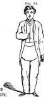
FIG. 24. SIGN OF THE MASTER OF THE SECOND VEIL.

"The hidden hand lets the other initiates know that the individual depicted is part of this secret Brotherhood and that his actions were inspired by the Masonic philosophy and beliefs. Furthermore, the hand that executes the actions is hidden behind cloth, which can symbolically refer to covert nature of the Mason's actions." - VC