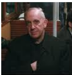
"Hidden Hand" "The Jesuits are a Military Religious Order of the Roman Catholic Church; Masonic and other oaths."