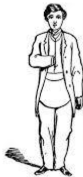
SIGN OF THE MASTER OF THE SECOND VEIL.