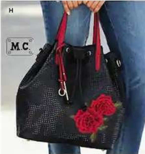
H. Rosa Bucket Bag by Marc Chantal Beautiful blooms and diamond-shape cutouts bring striking style to this super-roomy oversize bag. One outside pocket; 4 inside pockets; lariat-style closure. Adjustable, removable carrying strap. Synthetic. 12 3/4" w x 13 1/2" h x 6 3/4" d. Black.

WA772605 Misses $59.99 $49.99 WA772606 Plus $69.99 $59.99