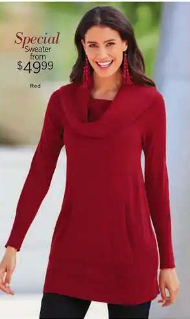
G. NEW! Mix It Up Convertible Sweater For fun, flattering style, shape or wear the versatile cowl to match your mood or outfit. A handy kangaroo pocket plus wide rib knit cuffs and hem make this lightweight sweater a sure favorite. Acrylic; machine wash. Imported. Misses S-XL. Plus 1X-3X. Choose Red or Gray.

WA772605 Misses $59.99 $49.99 WA772606 Plus $69.99 $59.99