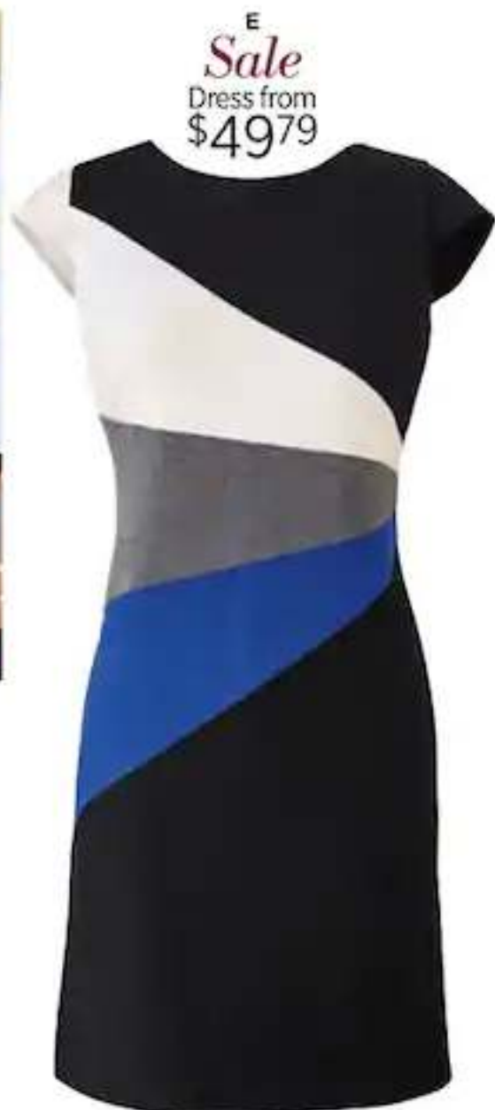
E Sale Dress from $49.79