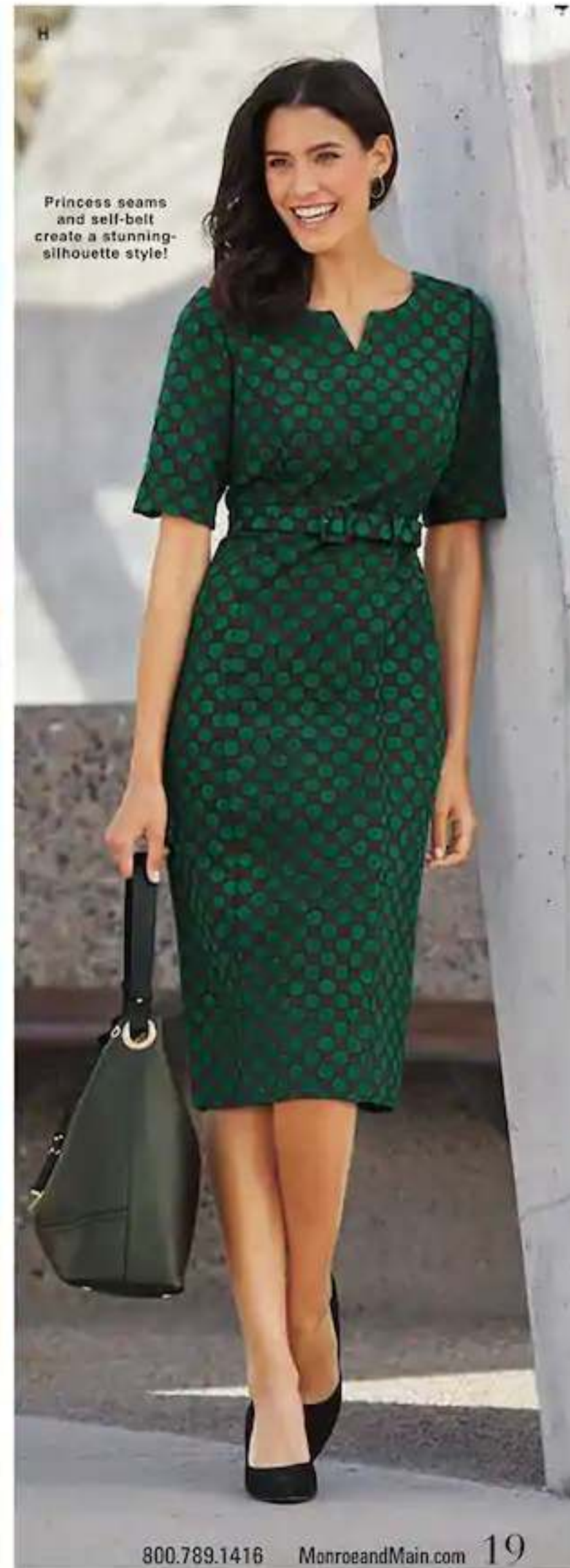
H Princess seams and self-belt create a stunning-silhouette style!