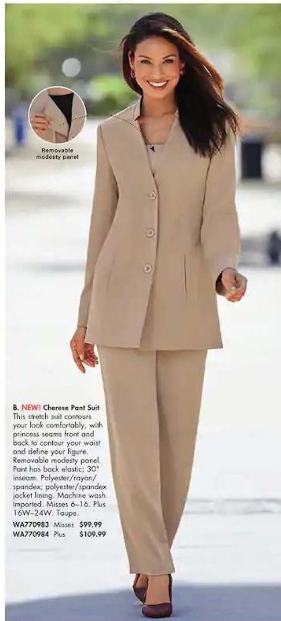
B. NEW! Chere Pant Suit This stretch suit contours your look comfortably, with princess seams front and back to contour your waist and define your figure. Removable modesty panel. Pant has back elastic; 30" inseam. Polyester/ rayon/ spandex; polyester/ spandex jacket lining. Machine wash. Imported. Misses 6-16. Plus 16W-24W. Taupe. WA770983 Misses $99.99 WA770984 Plus $109.99