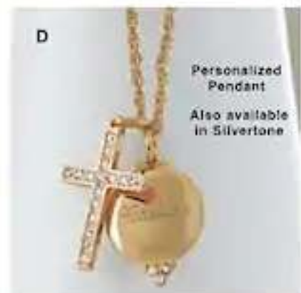
D Personalized Pendant Also available in Silvertone

C Special Tunic from $49.99 NEW color! White