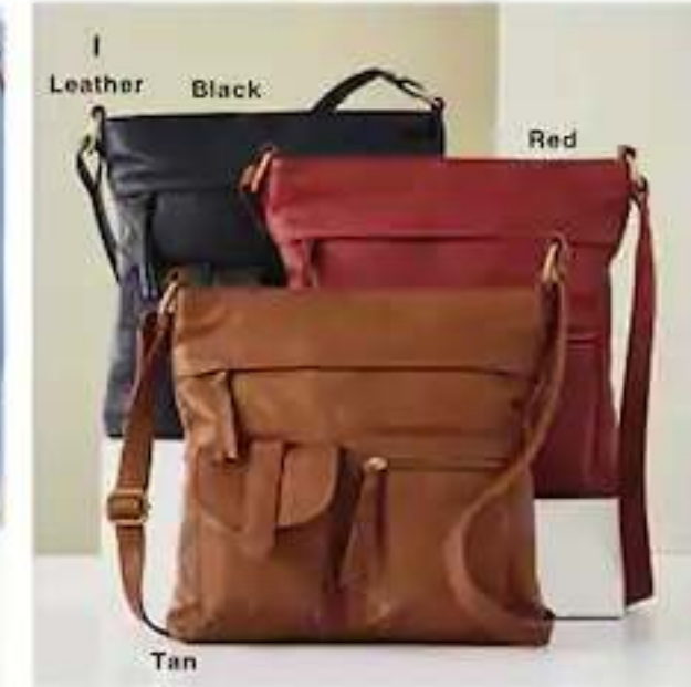
I. Manhattan Bag Big-city good looks in soft, genuine leather with rippled shading. Detailed pockets in front and back with 3 pockets inside. Top zip. Adjustable carrying strap. 12" w x 12" h x 1 1/2" d. Choose Tan, Red or Black.