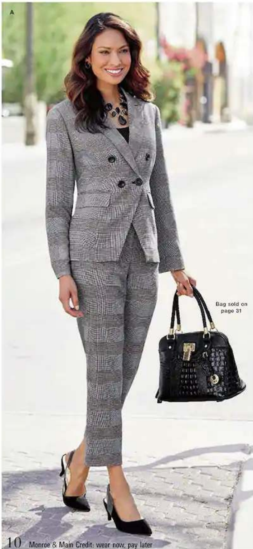
Bag sold on page 31