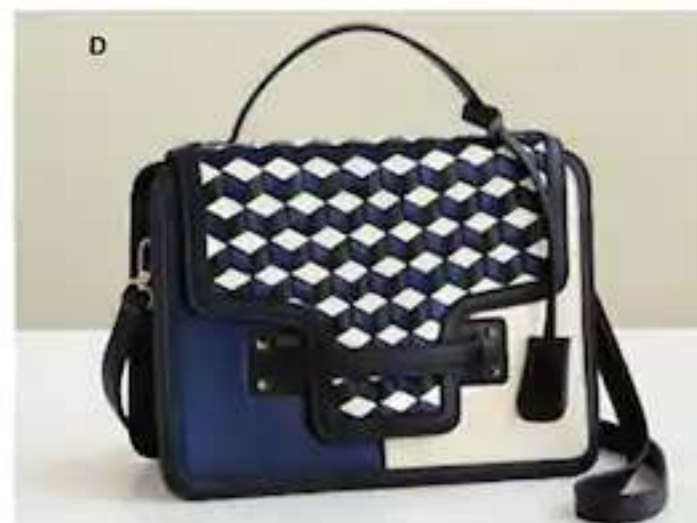
A. NEW! Glen Plaid Skirt Suit Classic plaid gets sculpted and shaped in such a feminine, flattering way here. Skirt has side/back elastic; back zip. 30" l. Polyester/spandex; polyester trim with polyurethane coating. Machine wash. Imported. Misses 6-16. Plus 16W-24W. Black/White/Cobalt. WA770985 Misses $139.99 WA770986 Plus $149.99 C. NEW! Sisley Blouse Two pleated skirts and cuffs create flattering flair as they move gracefully about you. Polyester; machine wash. Imported. Misses S-XL. Plus 1X-3X. Navy. WA770637 Misses $49.99 WA770638 Plus $59.99 D. NEW! Checkered Weave Satchel Interlaced satchel weaves eye-catching sophistication. Magnetic flap and center zip. One outside pocket; 3 inside pockets. Removable, adjustable strap. Synthetic. 12" w x 9 1/4" h x 4 1/4" d. Black/Blue. WA771375 $119.99