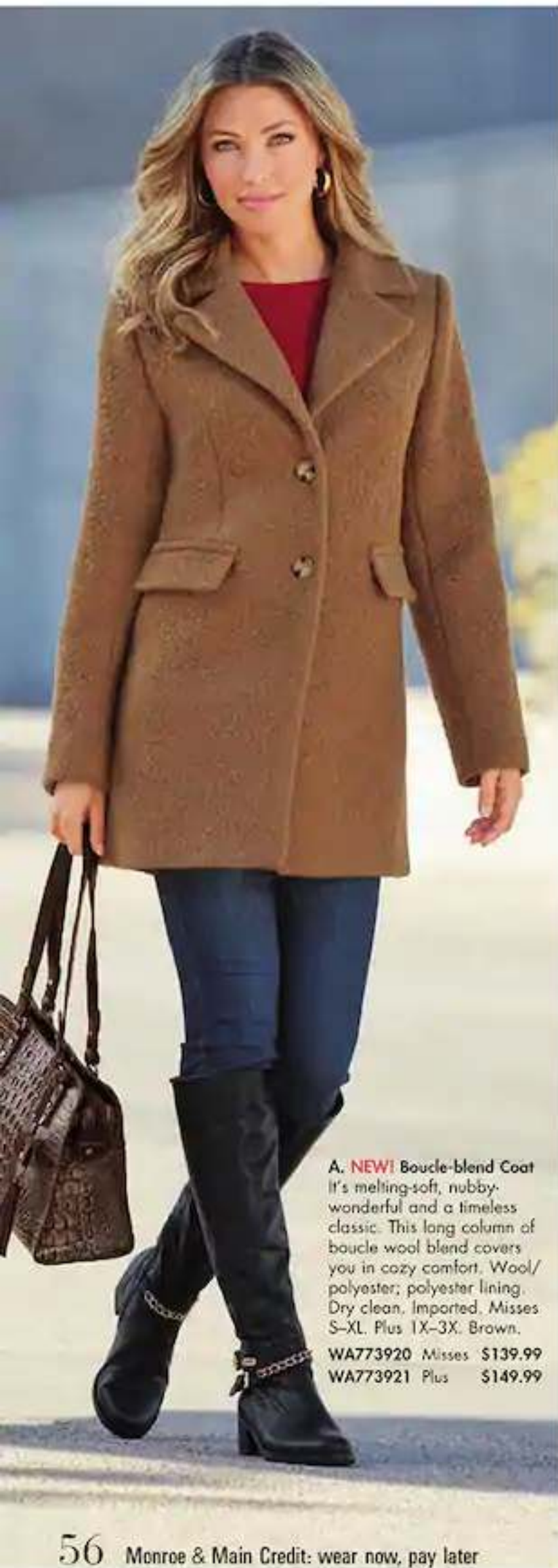
A. NEW! Boucle-blend Coat It's melting-soft, nubby-wonderful and a timeless classic. This long column of boucle wool blend covers you in cozy comfort. Wool/polyester; polyester lining. Dry clean. Imported. Misses S-XL. Plus 1X-3X. Brown. WA773920 Misses $139.99 WA773921 Plus $149.99