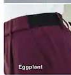
E. Any Way You Tie It Top A versatile wardrobe staple with an attached self-fabric scarf you can knot, drape or tie in a bow. Semi-sheer. Polyester; machine wash. Imported. Misses S-XL. Plus 1X-3X. Choose Gardenia or Gold. WA751363 Misses $59.99 $49.99 WA751364 Plus $69.99 $59.99 F. NEW! Abigail Easy Trouser Pant Long, lean strides showcase a smooth flat front. These stretch twill woven pants combine the comfort of a knit with professional boardroom polish. Elastic waist; 27" inseam. Polyester/rayon/spandex; machine wash. Imported. Misses S-XL. Plus 1X-3X. Choose Navy Plaid or Eggplant. WA770632 Misses $69.99 WA770631 Plus $79.99

The versatile self-fabric scarf ties 3 different ways!