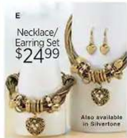
E Necklace/Earring Set $24.99 Also available in Silvertone