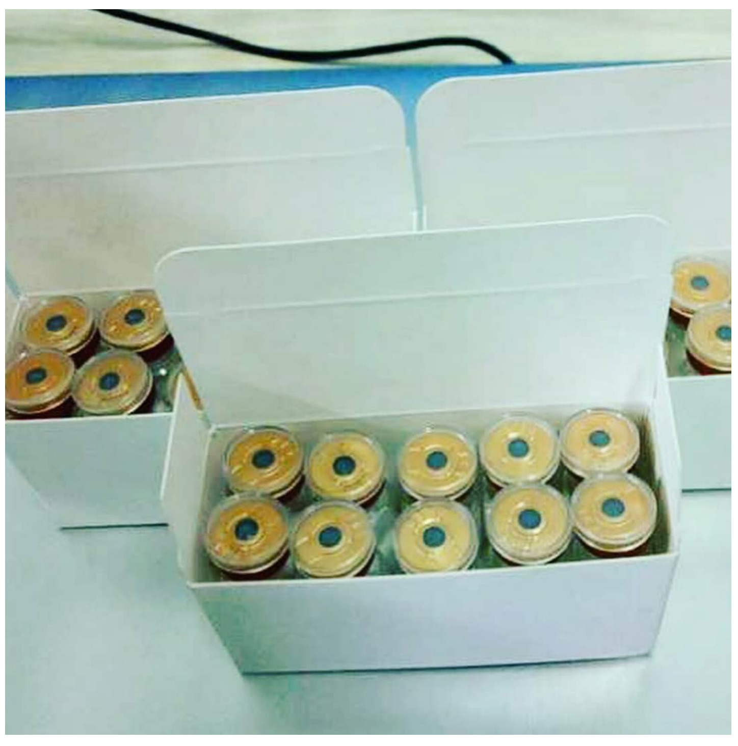
It is a variant of Dihydrotestosterone (DHT which is the other half of the dihydrotestosterone found in most anabolic steroids. It is an addition derived from testosterone and DHT is a dihydrotestosterone derivative. It's an alternate name for the anabolic steroid stanozolol. Those who buy Winstrol online can look elsewhere for an injectable version. However, this site makes it clear that there will be to much strain of testosterone that is not available as an injectable steroid. Those who buy Winstrol online can look elsewhere for another steroid alternative. However, this option is much better without the additional cost of Oral C17- aa steroids. If you buy Winstrol online, chances are that it comes in two forms. One is a mouth spray and the other is a long stay at a Winstrol long- acting cycle. As with all steroids, there are always dangers and dangers to use it safely. Winstrol can cause liver damage and it is important to remember that in order to use Winstrol successfully, you also need to be sure that you are taking into account the following: The androgenic side