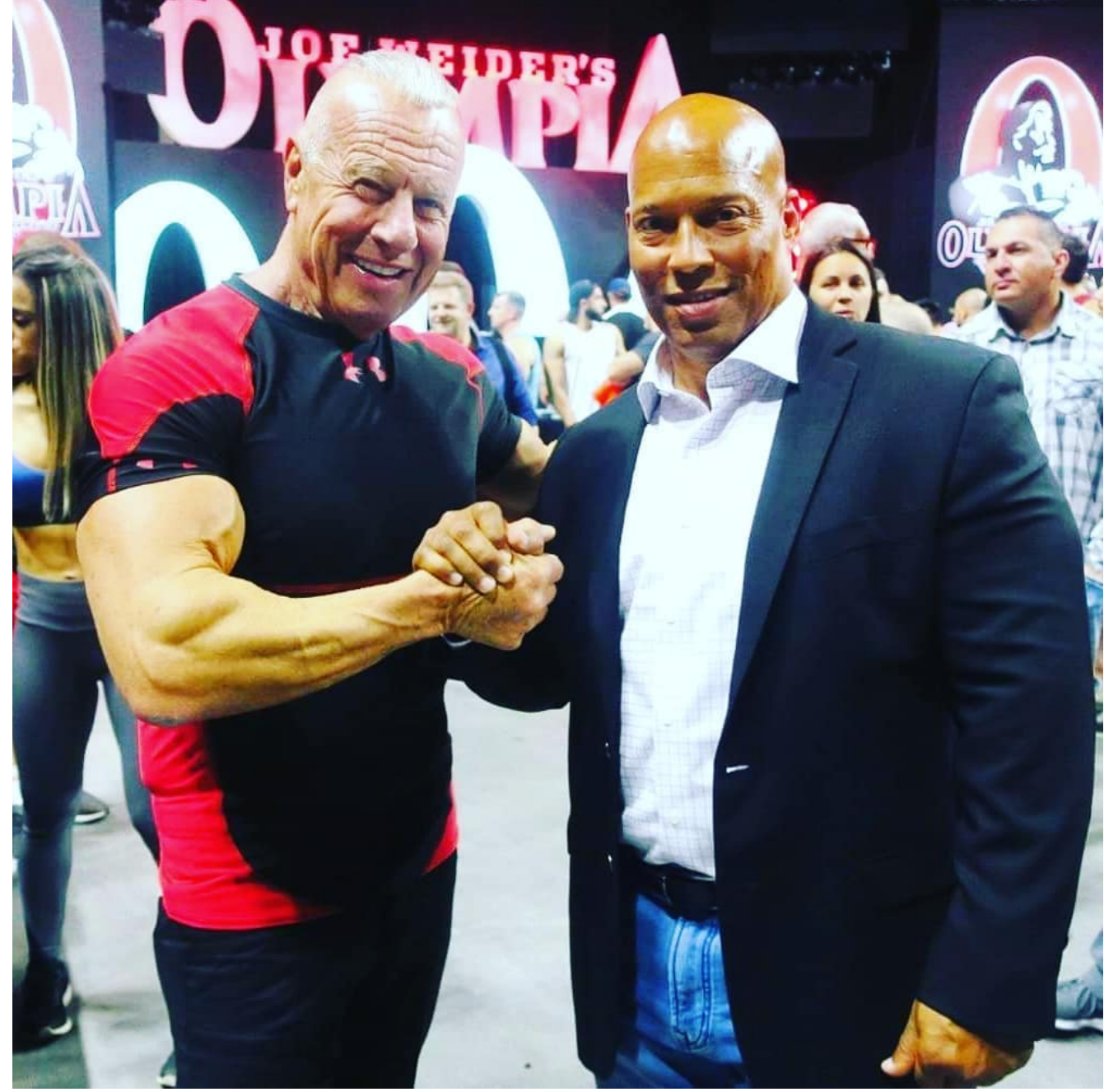
#gymmotivation #gym #gymvirtual #gymtime #fit #fitmom #fitnessmotivation #fitnessgirl #fitnesslifestyle #cardio #cardioworkout #workout #fitworld #sweden #fitbogota #fitgirl #fitnnes #gymlife #motivacion #loveyourbody #bodypositive#boxing #miniband #boxinggirl #boxingworkout #boxinglife#curvygirlfitness#rutinasgym#minibands

The weight loss effect of Winstrol on reducing body fat is minimal. It does not appear to be associated with any side effect. If you are on a calorie low or extremely low diet, a Winstrol injection cycle is probably not what you are looking for. On average, male bodybuilders take one for the first six weeks, then up the dose to two Winstrol 50mg pills (100mg per day, divided into two daily doses, for about two weeks prior to a show. Your healthy hair follicles are totally toned down to a level where they become incapable of producing hair growth. This can lead to loss of hair from various parts of the body and even baldness. Some bodybuilders and athletes are incredibly touchy about the subject. But if you check out some online discussion forums for bodybuilders, Winstrol can be a subject of intense discussion. People who are into steroids say that it isn't about gaining fat, but that it is not so much about calories as it is about being "clean". Winstrol can be used for bulking yet it is more effective for cutting and strength. It can improve the efficiency of other hormones and boost free testosterone.