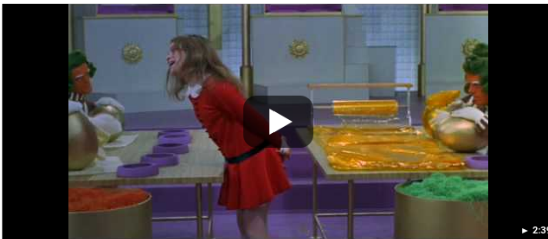
Veruca Salt - I Want It Now (Willy Wonka and the Chocolate Factory ...

https://www.youtube.com/watch?v=TRTkCHE1sS4 ▼