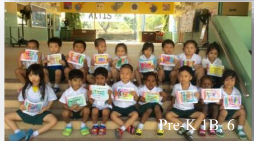
Pre-K 1B, 6