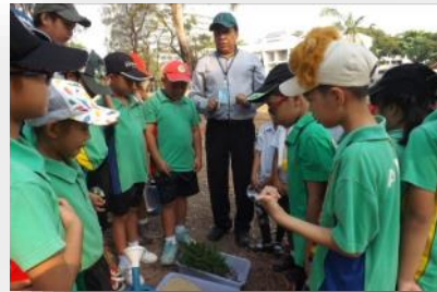
Experiment on Erosion by Grade 2 Trail Blazers