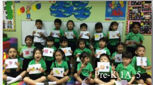
Pre-K 1A, 5