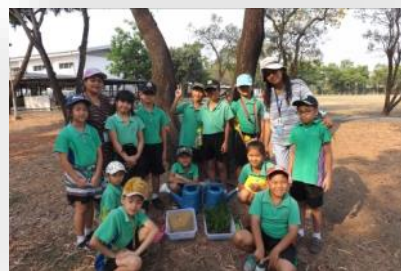
Experiment on Erosion by Grade 2 Kestrels