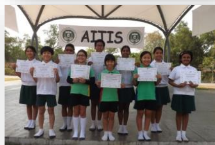
Gemstone Awards Recipients