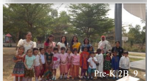
Pre-K 2B, 9