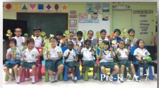
Pre-K 2A, 7