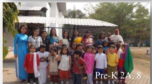
Pre-K 2A, 8