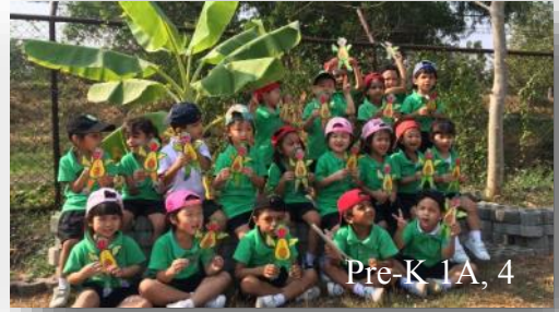
Pre-K 1A, 4