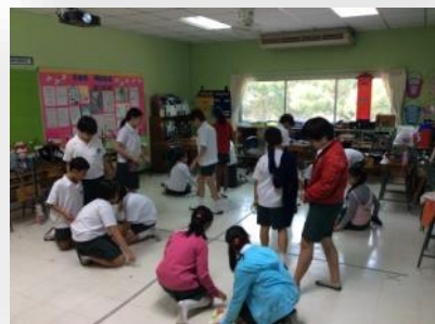
Math Project by Grade 5 Voyagers