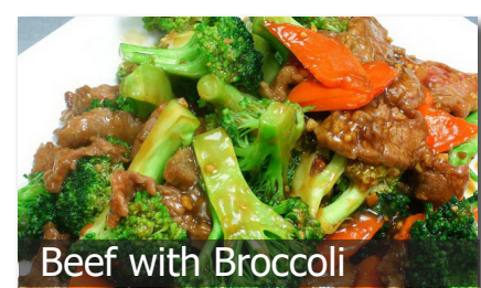
Beef with Broccoli

$9.50 BANZAI NOODLES Spicy Korean noodle soup with your choice of topping: • chicken, beef, pork, or vegetable for $1 more • shrimp or combination for $2 more Choose between five levels of spice: none, mild, medium, hot, or INSANE!