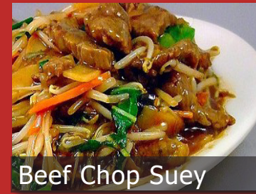
Beef Chop Suey

Shrimp with Snow Peas Cashew Nut Shrimp Hot and Spicy Shrimp 🌶️ Kung Pao Shrimp 🌶️ Shrimp with Garlic Sauce 🌶️ Pineapple Shrimp Shrimp with Lobster Sauce Shrimp with Vegetable Sweet & Sour Shrimp Szechwan Shrimp 🌶️ Shrimp with Broccoli Mango Shrimp Amazing Shrimp 🌶️ 13.50 Scallop with Vegetable 15.50 Scallop with Garlic Sauce 🌶️ 15.50