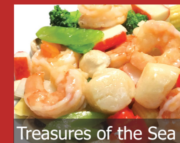
Treasures of the Sea