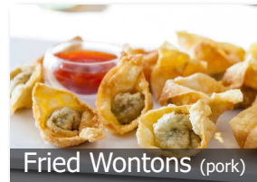
Fried Wontons (pork)