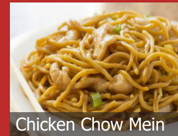
Chicken Chow Mein