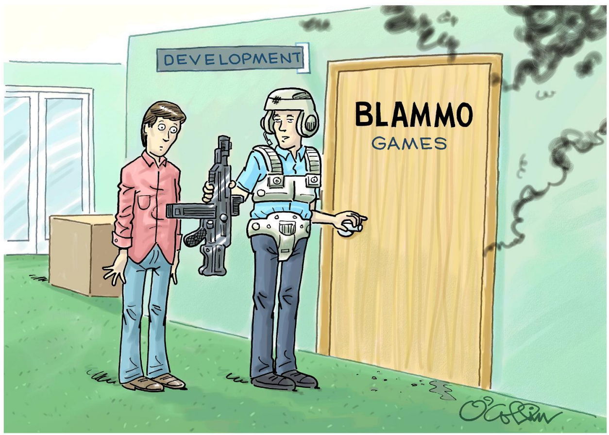
" YOU'RE ON YOUR WAY TO A CAREER IN VIDEO GAME DEVELOPMENT. YOU START AS A TESTER TODAY. JUST SURVEY THE FIRST FIVE LEVELS. HERE, YOU'LL NEED THIS. "

Remember : Higher education is not about doing the things you have always done in the same way you think is ok. It's all about learning new things, pushing yourself beyond your own border and managing tasks on a high level of difficulty so as to finally, at the end of the day, be able to convince an employer that you are the right stuff for just this game development job.