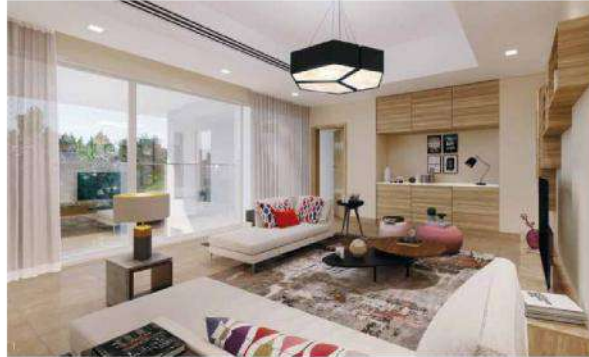
1. Family living room 2. Exterior side view 3. Exterior front view

The main entrance, as well as the living and dining spaces, all boast stunning views and access to the private courtyard, with extensive glazing around the circulation and living spaces to extend the space visually.