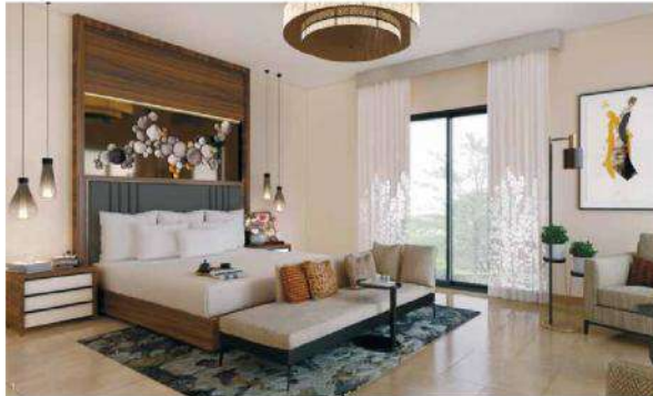
1. Master bedroom 2. Exterior rear view 3. Exterior front view

With amenities that complement a life of luxury and style, from the front elevation with signature Mondrian window to a double volume entrance space. Every aesthetic of the layouts create a sense of welcome.