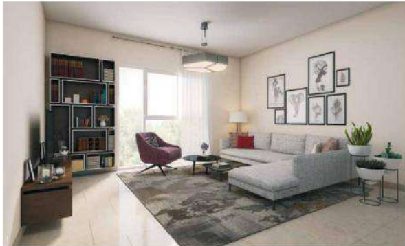
1. Family living room 2. Exterior rear view 3. Exterior front view

With maximum privacy as a design priority, these villas have been planned to enhance the sense of spaciousness. Beautiful Mondrian windows accent the entrance. Each of the three bedrooms features ample wardrobes, as well as spacious balconies. All interior finishes and materials have been selected to reflect a new level of luxury.