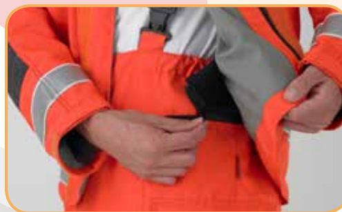
Coat and trouser zipping together to make one piece

Chest small – 4XL Height short, reg, tall and X tall