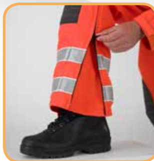
Zip gusset at leg bottom