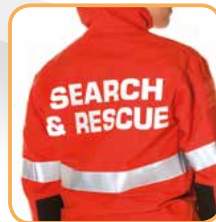
Opportunities for graphics