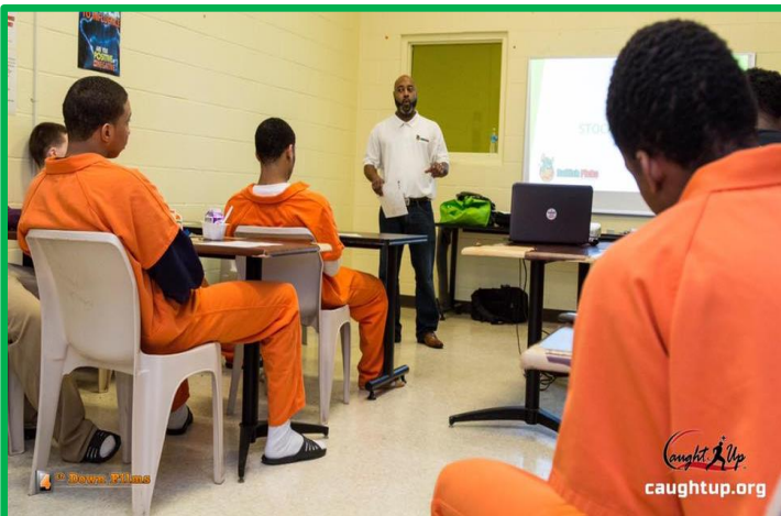
Spectrum Juvenile Detention Center