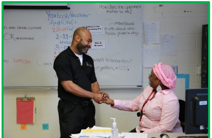
Educators love the Bullish program