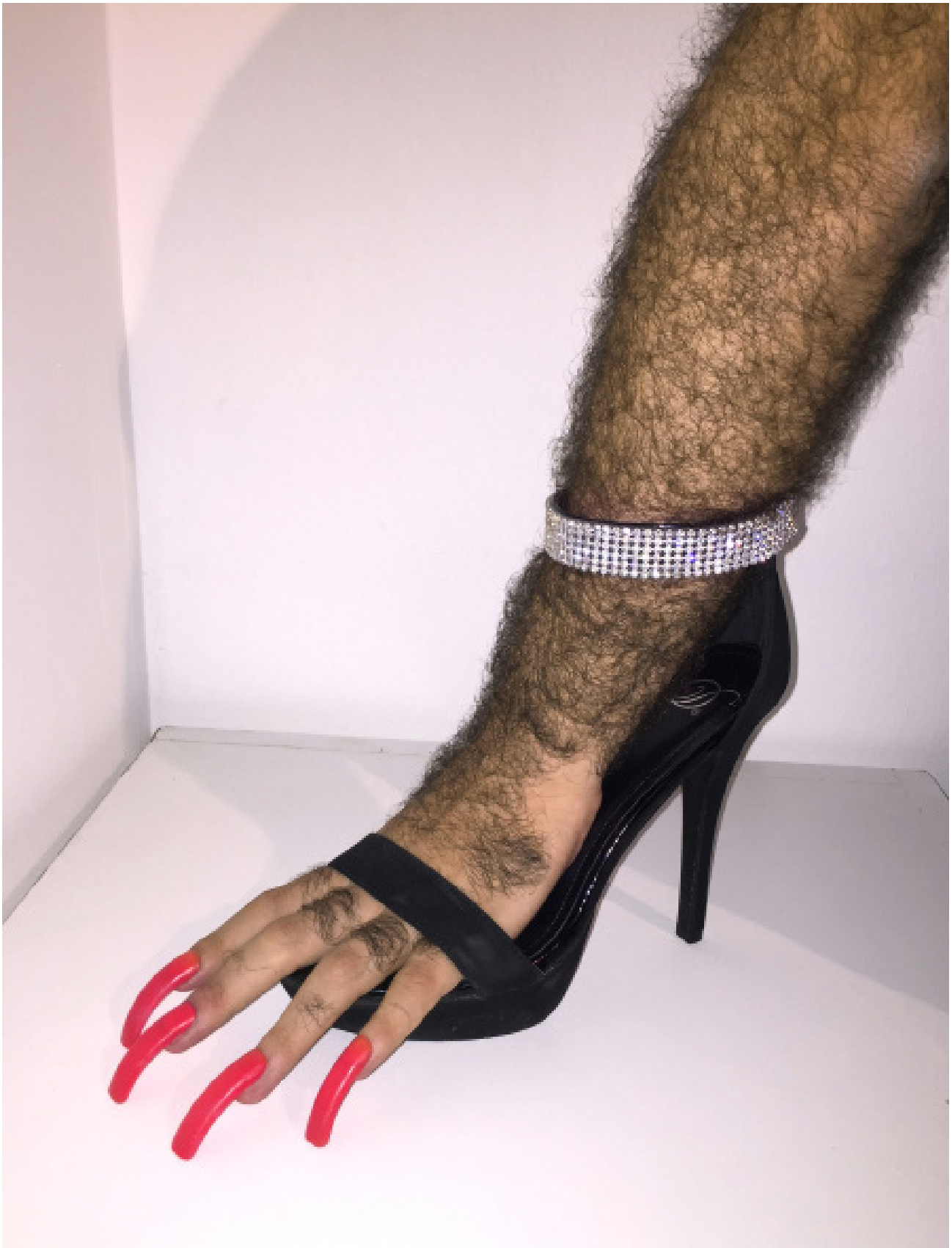
Uh La Lá LA La IA Fotografía 70 x 100cm (27.5 x 40 inches) ed 5 + 2 ap 2016