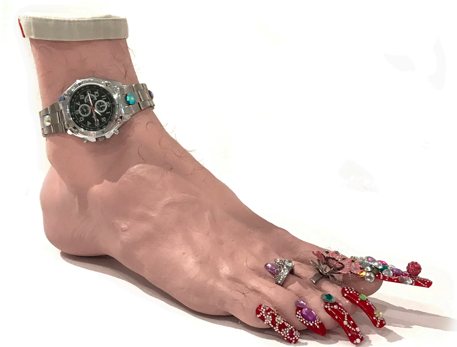
Foot #1 mixed materials 20 x 12.7 x 33cm (8 x 5 x 13 inches) 2018