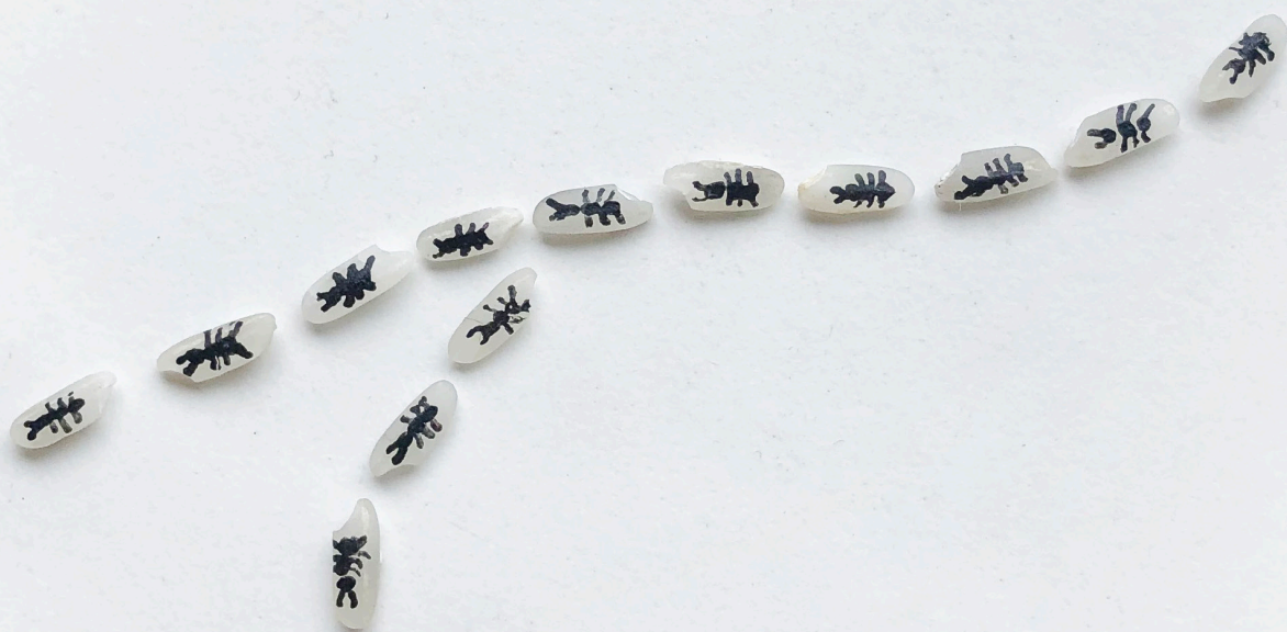
hormiguera (parte I) 1000 granos de arroz con tinta Instalación Medias variables 2022