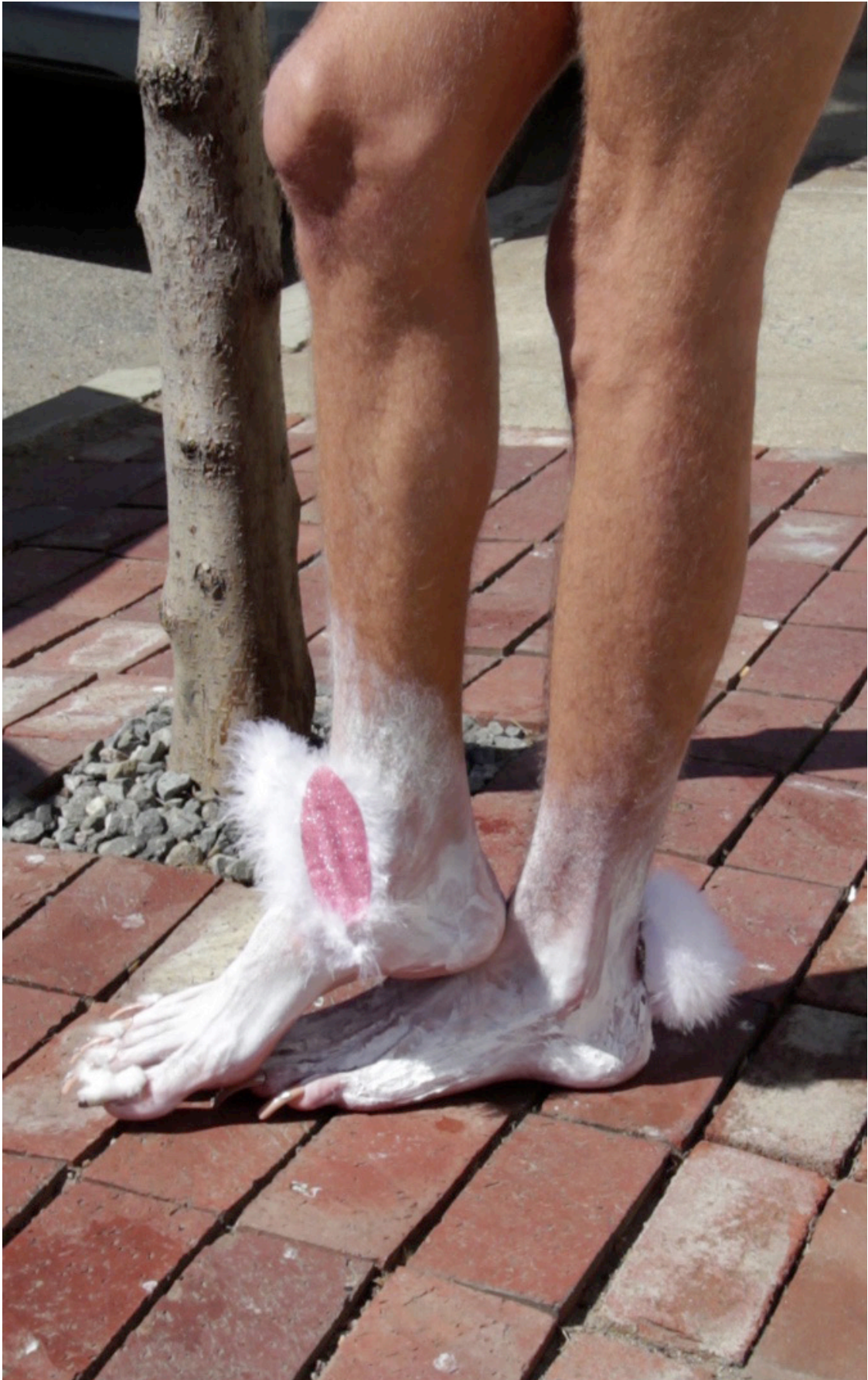
Bunny Video 1:47min ed 3 + 2 ap 2018