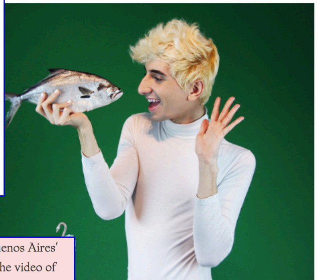
Bianchic, Nailture (2015)

The work is eerie, surreal, and larger than life.