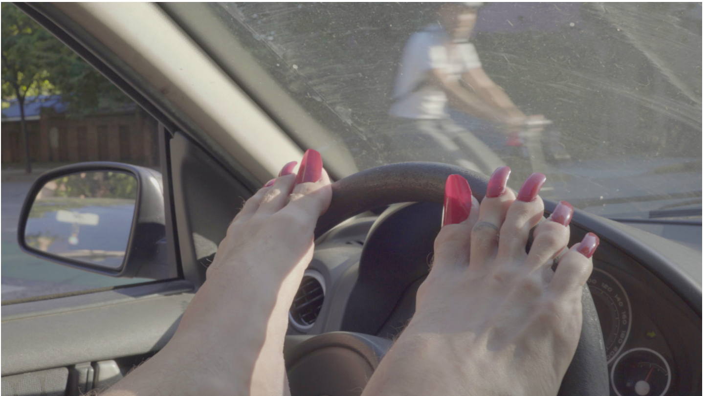
Fashion Number One Rule Number Rule Number One Video, 14:30min ed 3 + 2 ap 2017

link: https://www.youtube.com/watch?v=RPBq2fv7edg