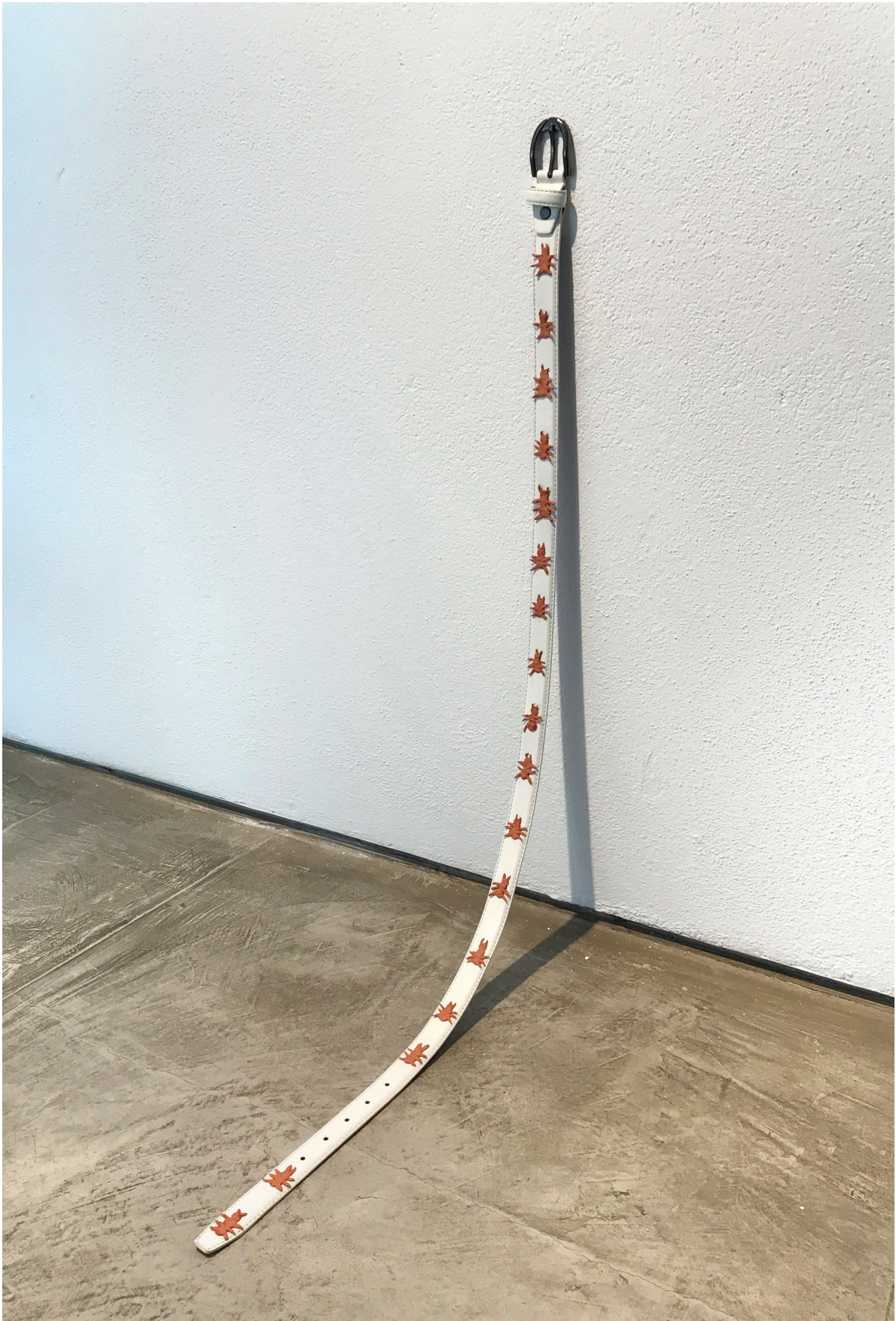
Cinturón de hormigas Cerámica sobre cinturón 70 x 5cm 2021