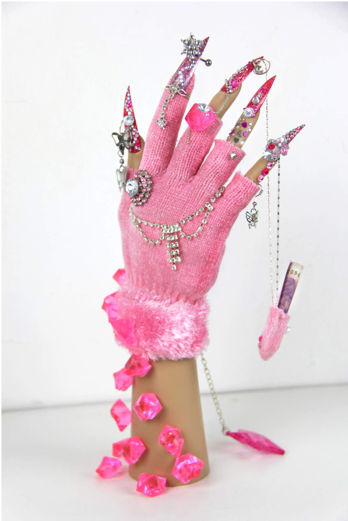
Nailture #3 mixed materials 35.5 x 29 x 12.7cm (14 x 9 x 5 inches) 2016