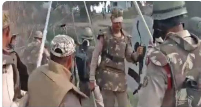
Indian American Muslims condemns forced evictions and police brutality in Ass... The Indian American Muslim Council (IAMC) condemned the violent eviction drive in Assam, which was aimed at driving Muslims siasat.com

#Islamophobia_in_india #HindutvaStateTerror