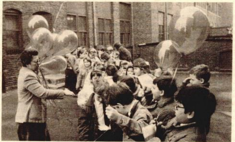
THE STUDENTS OF SAINT CATHERINE'S long Catholic Schools Week celebration held SCHOOL patiently await the distribution of balloons to be released as part of the week