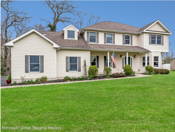
Monmouth Ocean Regional Realtors