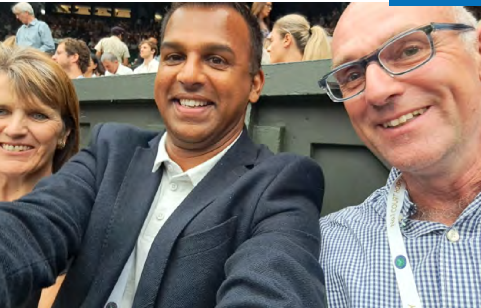
Photo is of Cambridgeshire volunteers on Centre Court.