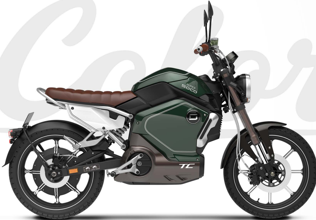
• VINTAGE GREEN

Exclusive classic Café Racer. Be an elegant biker.