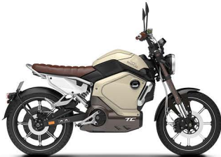
• KHAKI YELLOW