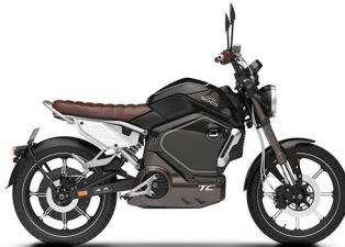
• DIAMOND BLACK