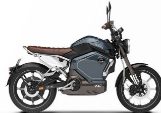
• DARK SEA BLUE