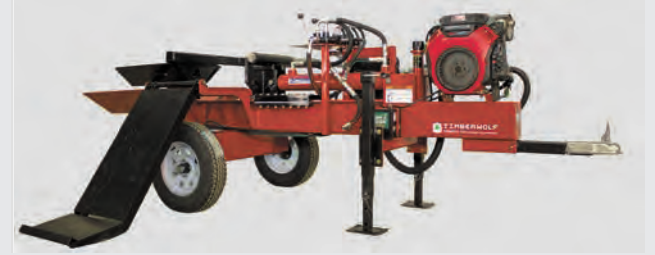
Alpha 5 & 6