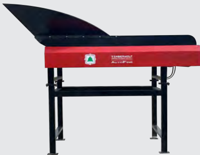
AutoFine Cleaning & Fines Separator