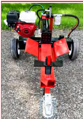
Optional 4-Way Wedge