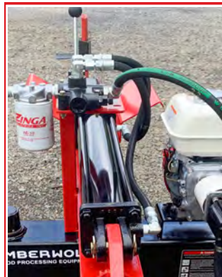
Powerful Hydraulic Cylinder