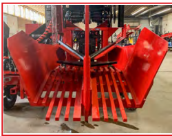
Optional 6-Way Wedge