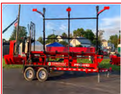
Folding Live Deck