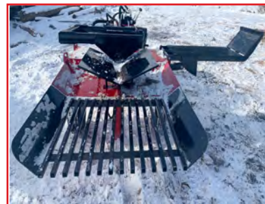
Log Lift & Table Grate