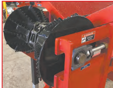
Greaseable Tension Adjusting Bearing