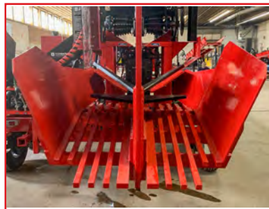
Optional 6-Way Wedge