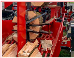
Optional 8-Way Wedge