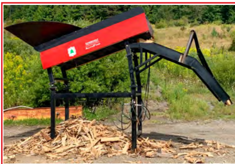
Strong and Efficient Hydraulic Drive