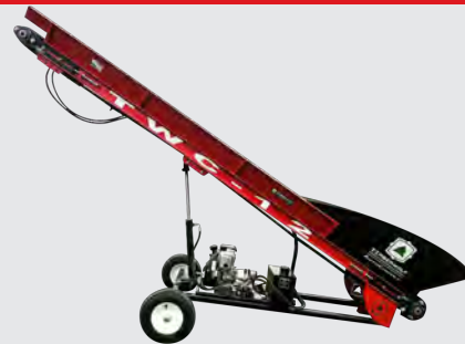
Conveyors to Fit Every Application