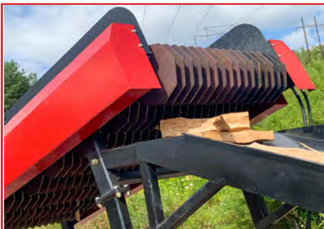
Bucket Load for Pre-Delivery Cleaning

Many different configurations are available to suit your operation's needs.