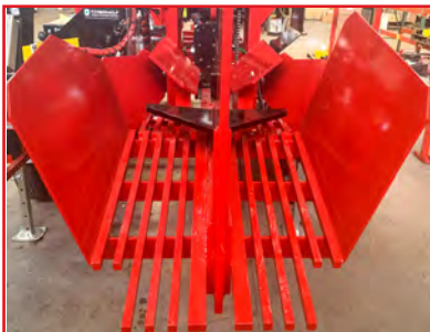
Standard 4-Way Wedge

We have the processor made to meet your needs!