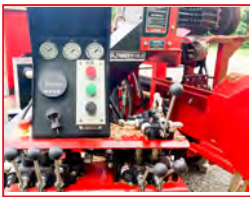
Heads Up Control Panel with Electric AutoCycle