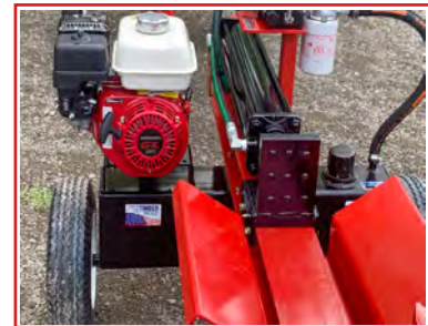
Powerful Hydraulic Cylinder