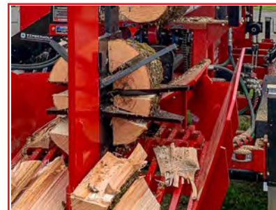
Optional 8-Way Wedge