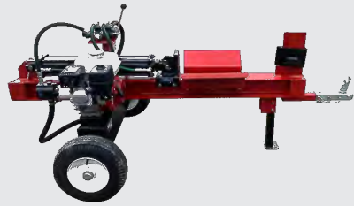
TW Classic Light Duty Splitters