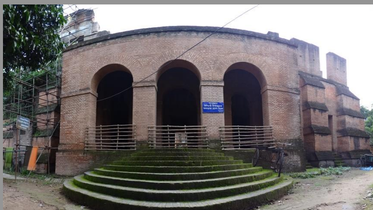
Clive House; Dum Dum